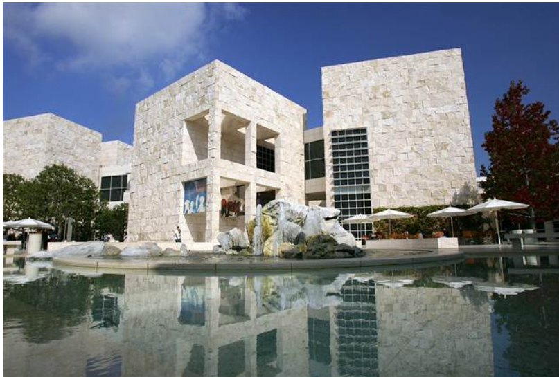
Will the Getty lose its newest star attraction?

Eileen Kinsella ( https://news.artnet.com/about/eileen-kinsella-22 ), March 30, 2016