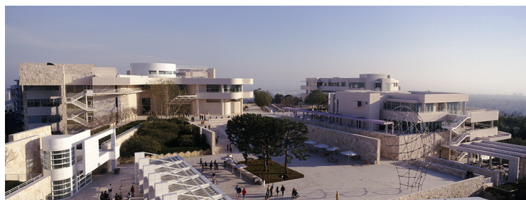
The Getty Center