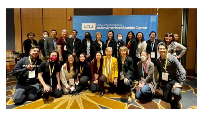
AASC Staff and AAPI Multimedia Textbook Project Staff at the 2023 AAPI Policy Summit

On February 10, 2023, over 320 people gathered at the Luskin Conference Center for the first AAPI Policy Summit themed, "Building Solutions for an Equitable Future." This was a culmination of two years of faculty engagement in policy research since the AASC received California state funds through Assembly Bill 85 (Chapter 4, Statutes of 2021) in April 2019. The Summit brought together policy makers, researchers, community based organizations, and members from the philanthropic and corporate sectors to discuss pressing issues affecting AA and PI populations. Cosponsored with the Asian American Pacific Islander Legislative Caucus and the Luskin School of Public Affairs, the summit featured over 20 studies, including data equity, combatting anti-Asian hate, immigrant