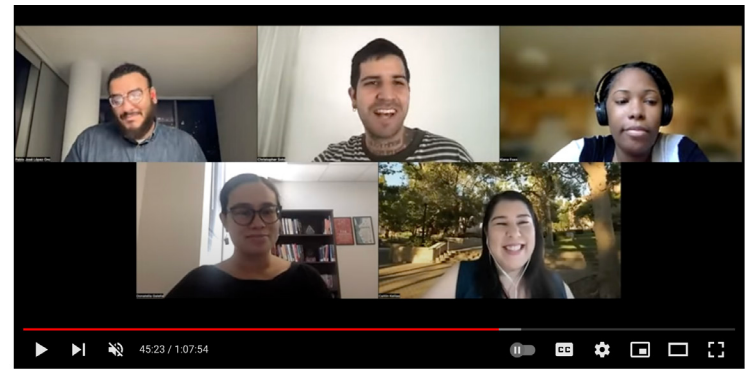
IAC Fall Forum 2022

on his book, <u>Transborder Los Angeles: An Unknown</u> <u>Transpacific History of Japanese-Mexican Relations</u> (University California Press, 2022) on April 5, 2023, at the Charles E. Young Research Library. This event was made possible by the Sugahara Project and co-sponsored by Library Special Collections and the ethnic studies centers and departments.