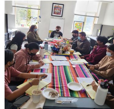
Students (above) in a California Freedom Summer retreat.

The CSRC expanded its community outreach: new partners include Future Leaders of America, Inner City Struggle, Youth Organize California, Power California, Funding the Next Generation, California Partners Project, and USC Equity Research Institute. Additionally, CSRC partnered with thirty-two (32) non-partisan youth organizing groups across California to implement the project California Freedom Summer. Foundation partners that played a role in CSRC programming this year include the Latino Community Foundation, The California Endowment, the Funders' Collaborative On Youth Organizing, the Stuart Foundation, the Bower Foundation, the McCune Foundation, the Santa Barbara Community Foundation, and the Glikbarg Family Foundation.