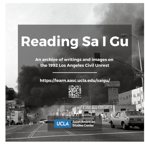
Reading Sa I Gu Event Promotion