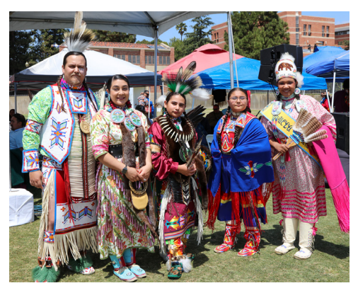
Pow Wow Participants