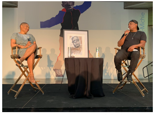
Joan Morgan and Chuck D at CAAM Photo credit: Bunche Center

Million Dollar Hoods Team 2021–2022 Photo credit: Bunche Center