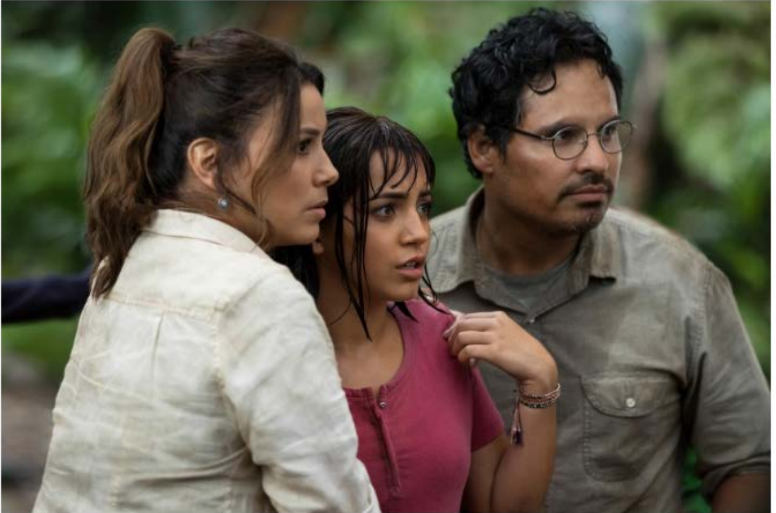
Eva Longoria, left, Isabela Moner and Michael Peña in "Dora and the Lost City of Gold."

version of "Dora the Explorer," titled "Dora and the Lost City of Gold," which features Latinos in the five leading roles, including Eva Longoria and Michael Peña.