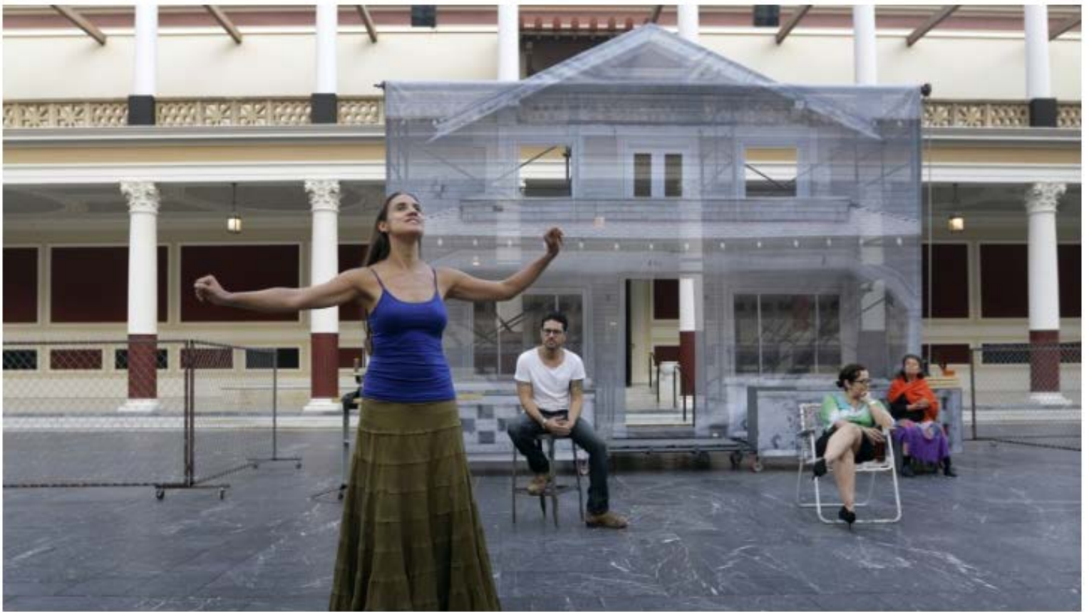
The cast of "Mojada: A Medea in Los Angeles" rehearses at the Getty Villa in 2015.

The statistics of Latino representation in theater mirror the stats elsewhere. Latinos received a paltry 3.5% of acting roles in Broadway plays or musicals in the 2014-15 season, according to a study conducted by the Asian American Performers Action Coalition.