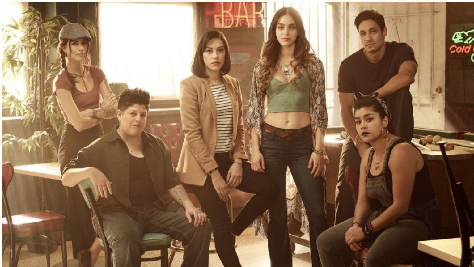
The Season 1 cast of "Vida."