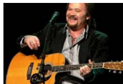
Travis Tritt going unplugged in Tobin Center