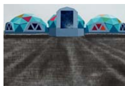
Artists navigate our place in the landscape