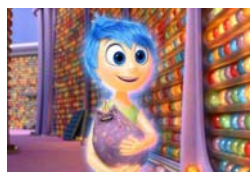
Pixar sets “Inside Out” close to its home