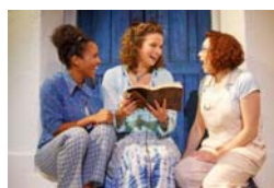
‘Mamma Mia!’ is still a lot of fun