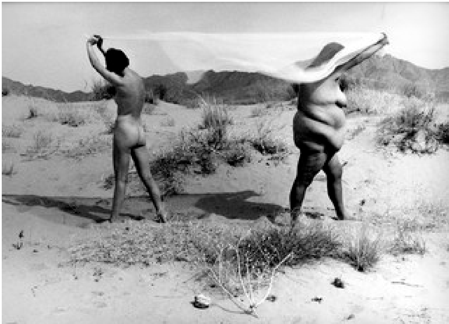
Courtesy of the artist and the UCLA Chicano Studies Research Center. © Laura Aguilar 5/19 Laura Aguilar, Stillness #26 , 1999.