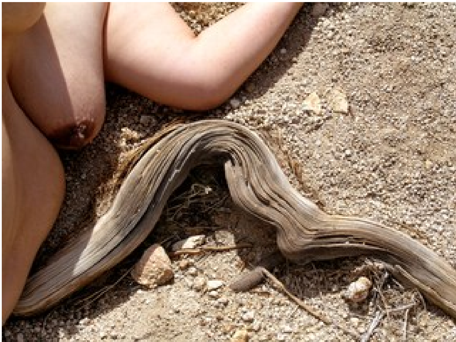
Courtesy of the artist and the UCLA Chicano Studies Research Center. © Laura Aguilar 2/19 Laura Aguilar, Grounded #108 , 2006.