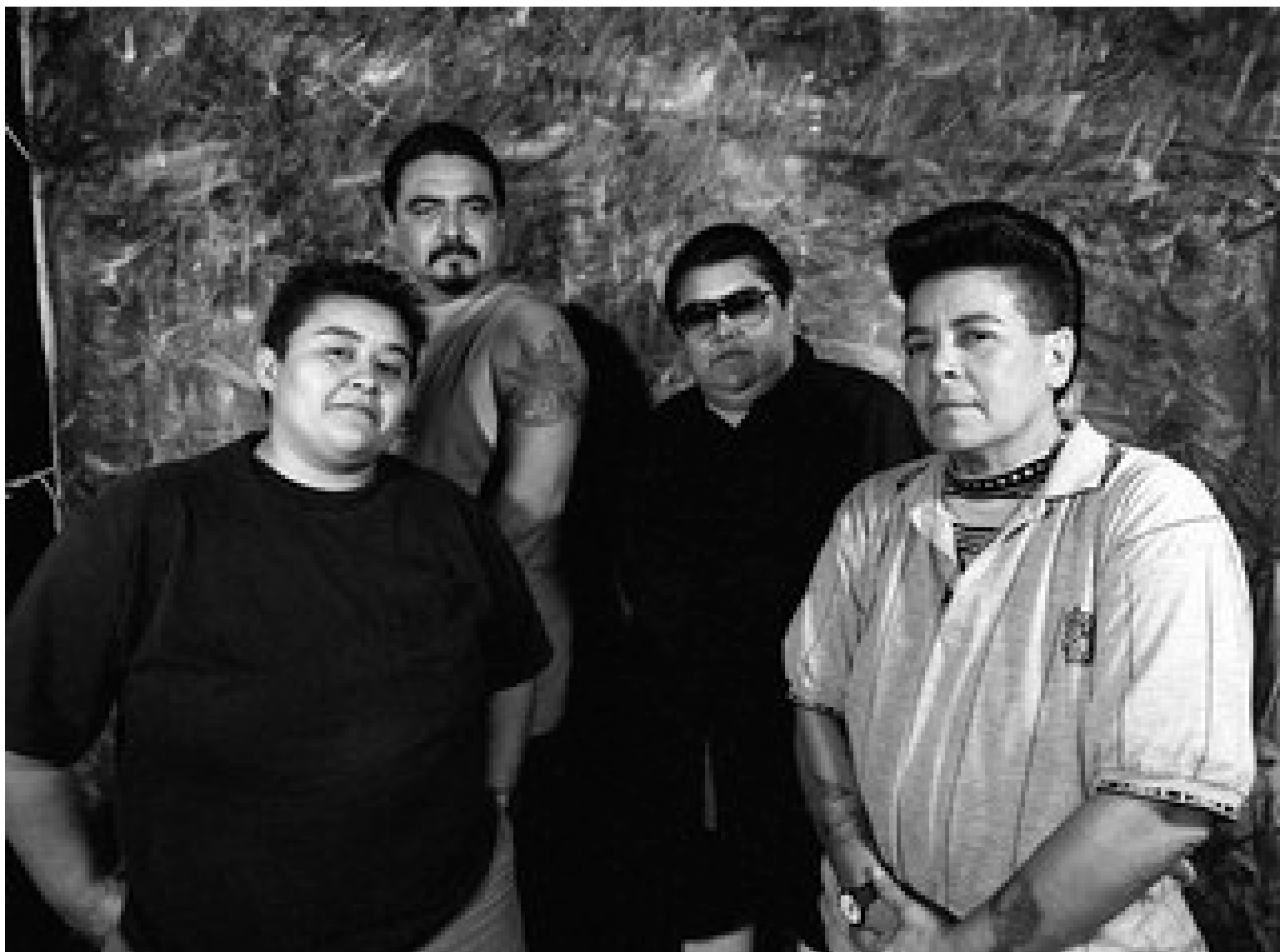
Courtesy of the artist and the UCLA Chicano Studies Research Center. © Laura Aguilar 18/19 Laura Aguilar, Plush Pony #18 , 1992.