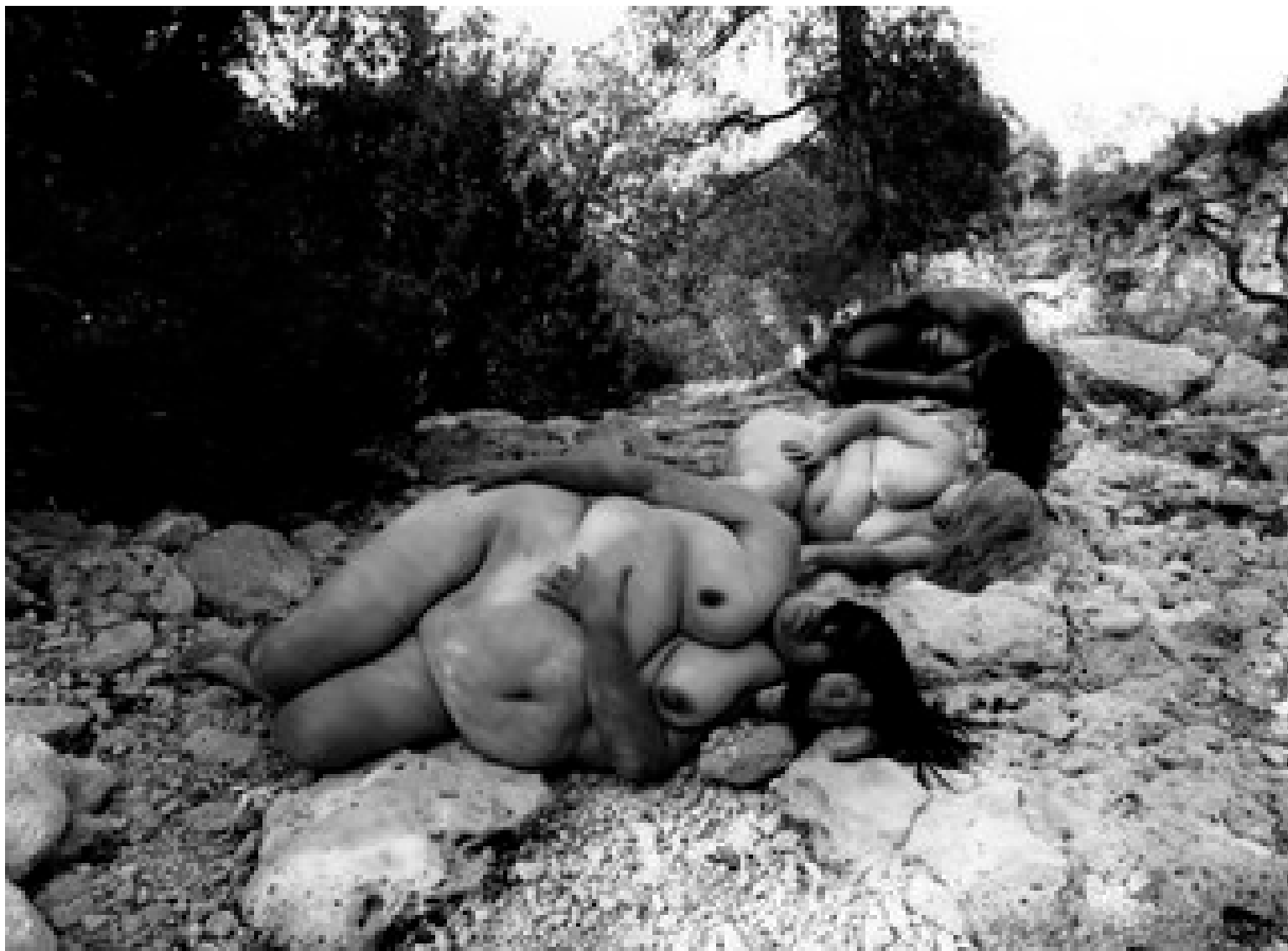
Courtesy of the artist and the UCLA Chicano Studies Research Center. © Laura Aguilar 7/19 Laura Aguilar, Motion #56 , 1999.