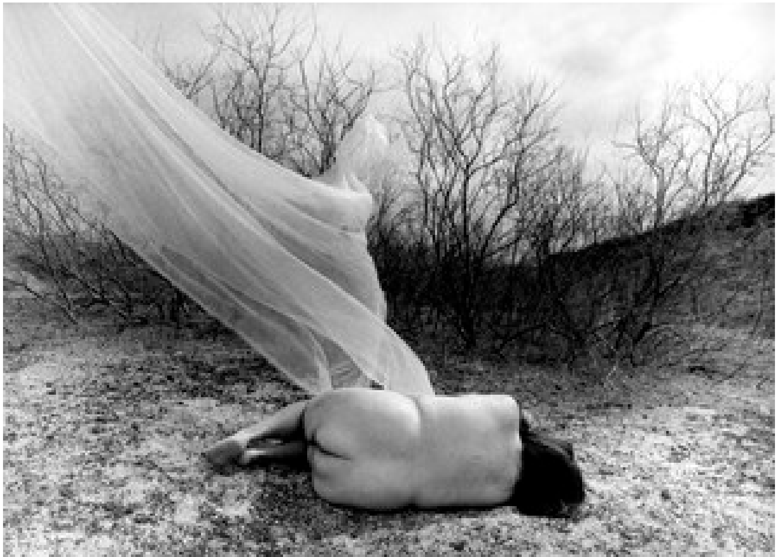
Courtesy of the artist and the UCLA Chicano Studies Research Center. © Laura Aguilar 4/19 Laura Aguilar, Stillness #25 , 1999.