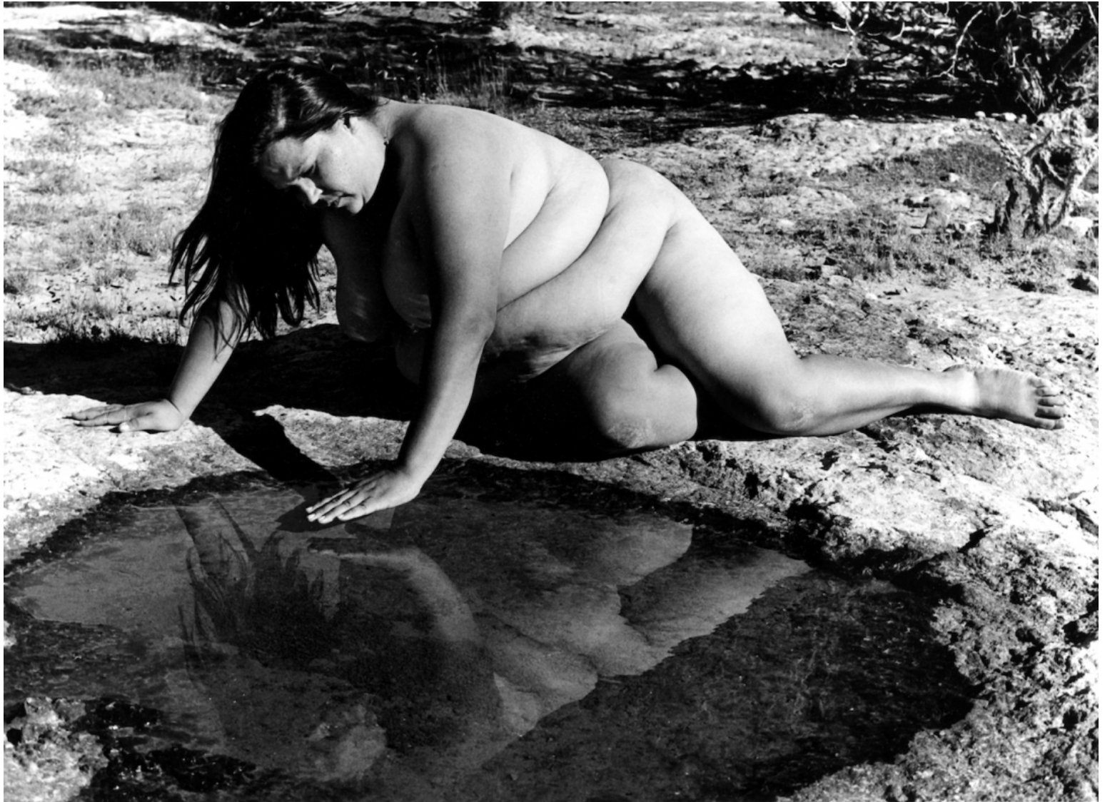
Laura Aguilar, "Nature Self-Portrait #14" (1996), gelatin silver print, 16 x 20 inches