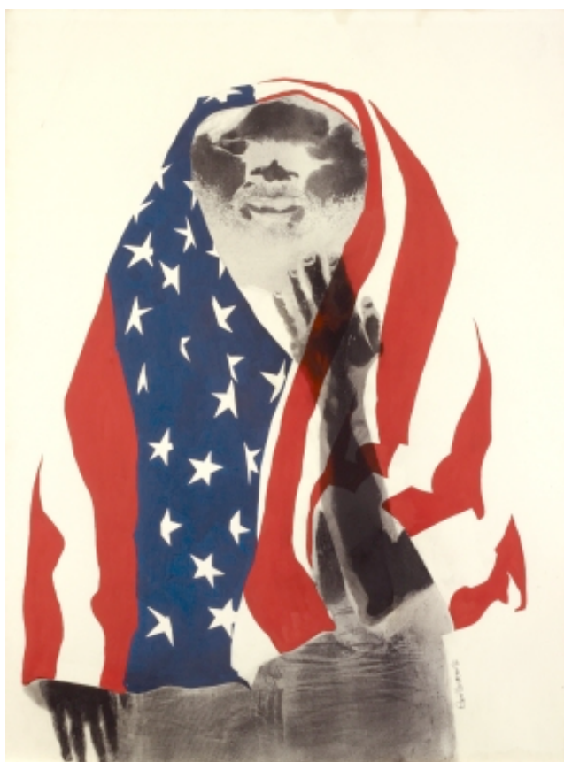
David Hammons' "American the Beautiful" at the Hammer Museum.

A wide-ranging exhibition and film series at the Hammer will delve into developments in African American art and film during two important decades.