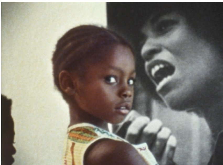
A scene from "Ashes and Embers" (1982), a film by UCLA alumnus Haile Gerima, who was part of a group of black film students known as the L.A. Rebellion.