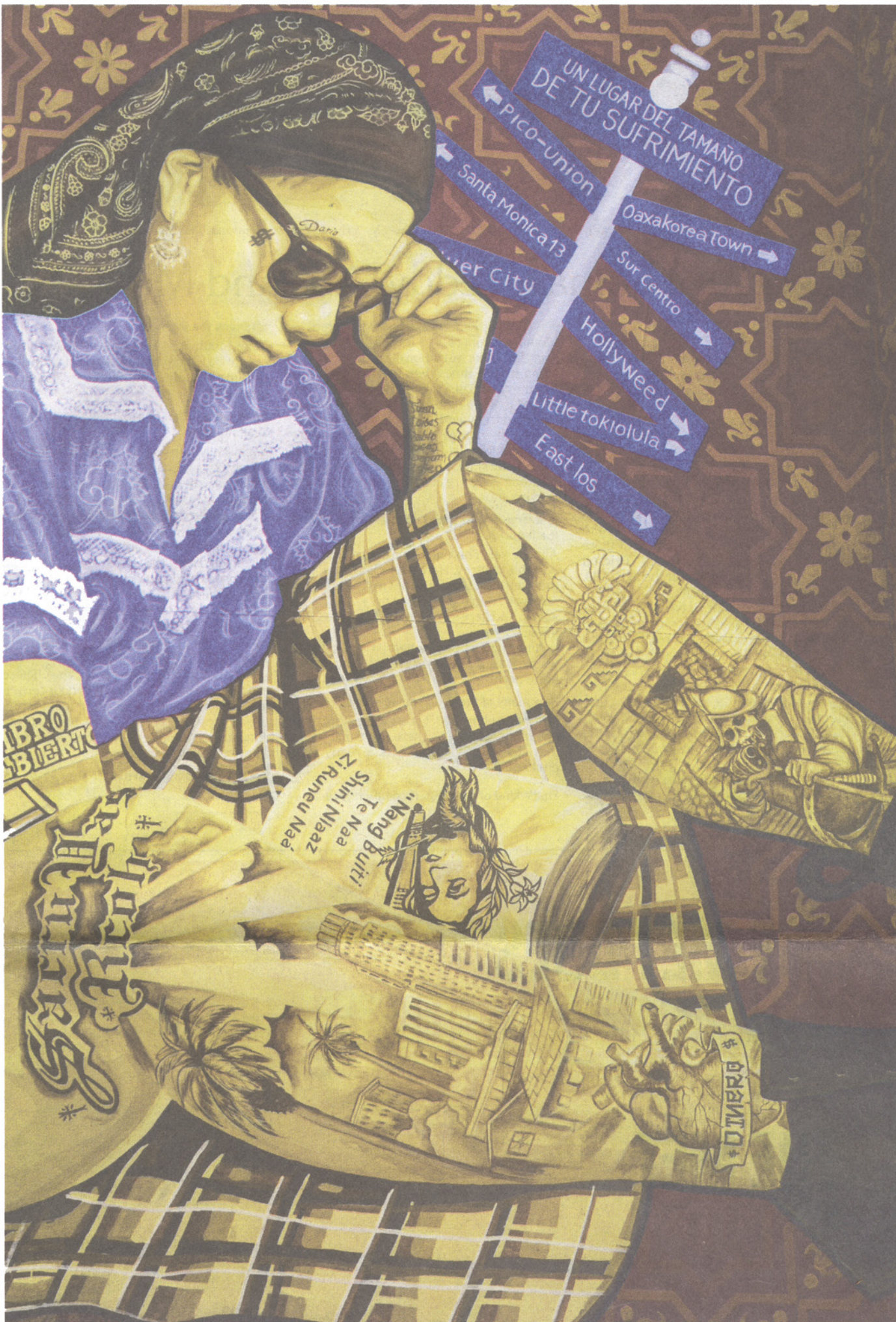
A detail from a mural by the Oaxacan artist collective Tlacolulokos, at the main branch of the Los Angeles Public Library.

One "LA/LA" exhibition, "The U.S.-Mex- CONTINUED ON PAGE C18