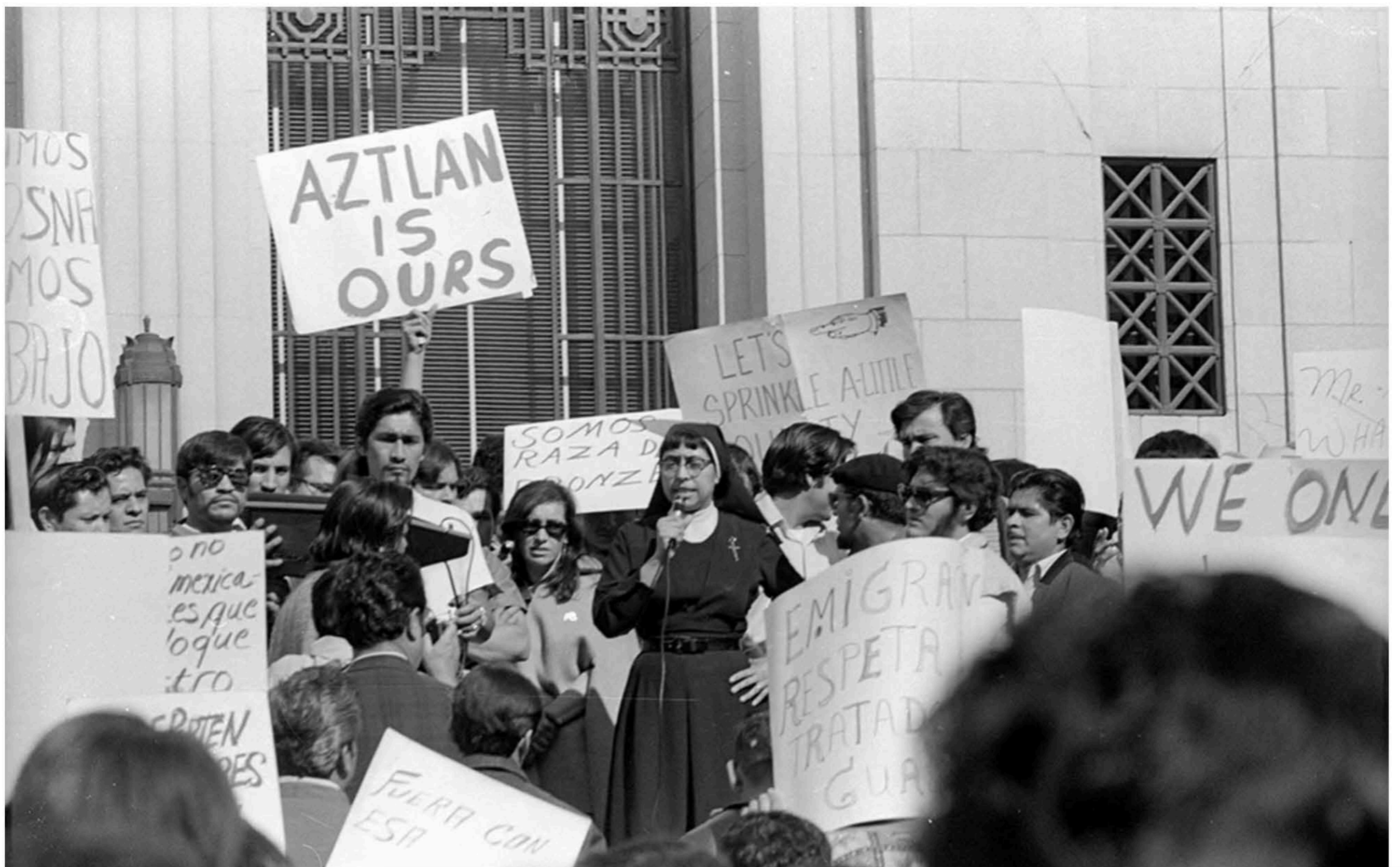
A nun speaks to protesters in front of the California State Building in downtown Los Angeles at an immigration march against the Dixon-Arnett Act on Jan. 22, 1972.