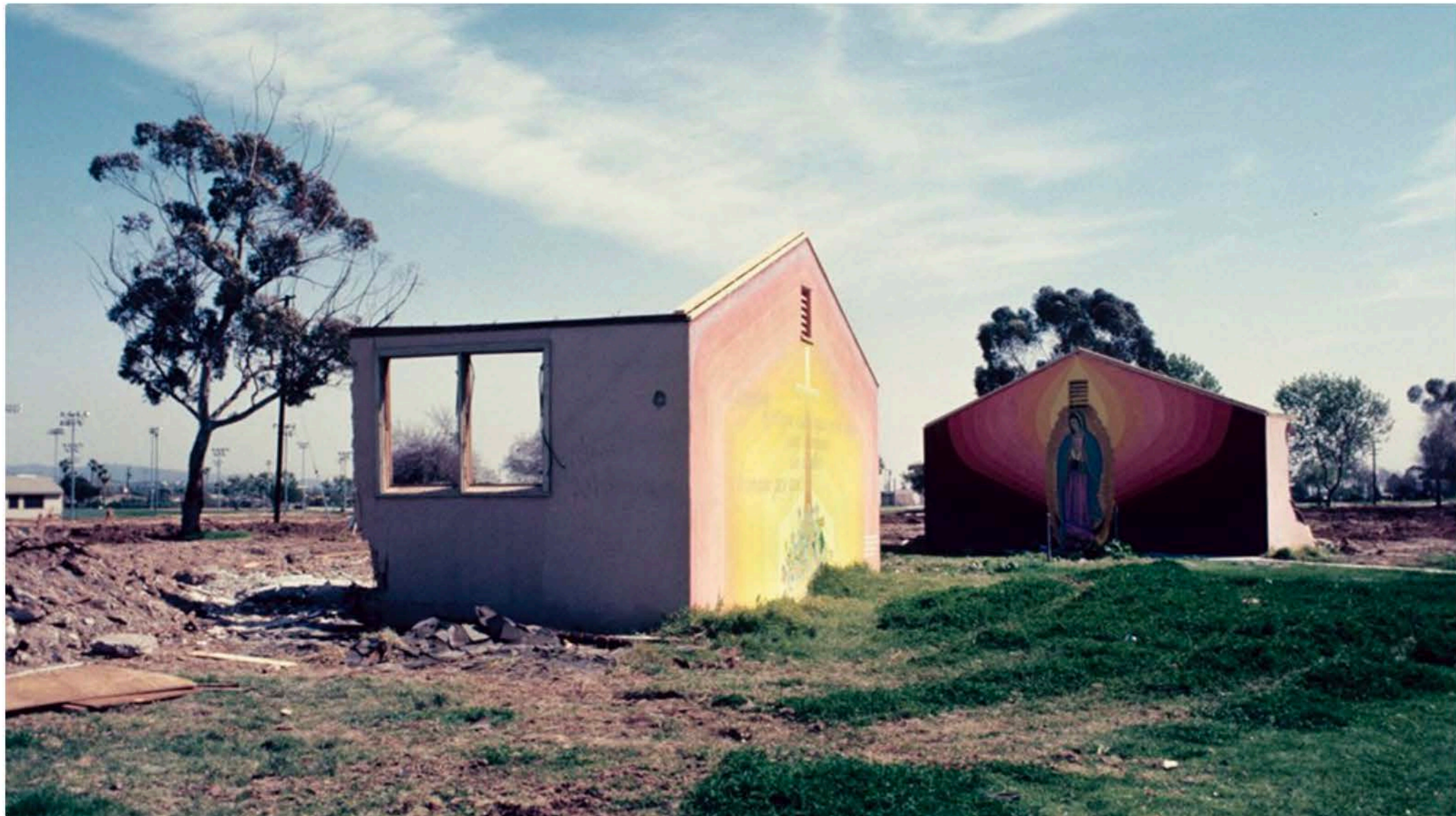
Shrine to the Virgin of Guadalupe at Maravilla Housing Project, Mednik Avenue and Brooklyn Avenue, East Los Angeles