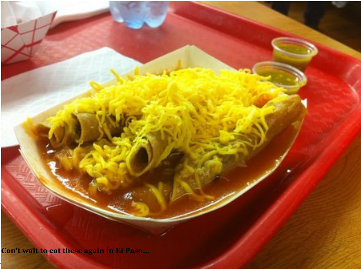
Can't wait to eat these again in El Paso...