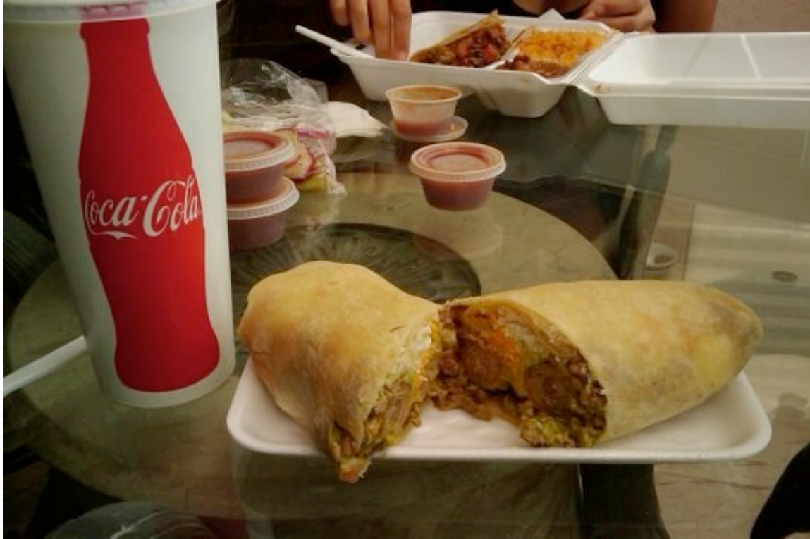
San Diego's 2-in-1 burrito, here I come!

April 10 (book release!): UCLA Chicano Studies Research Center, 144 Haines Hall, UCLA, Los Angeles, 1 p.m.; LA Plaza (near Olvera Street), 501 N. Main Street, Los Angeles, (213) 542-6200, 7 p.m.