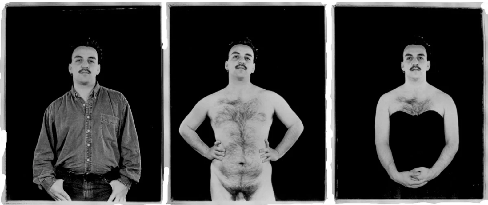
Laura Aguilar, Clothed/Unclothed #20, 1992.

These acquisitions may be a good barometer to track the success that Latinx art (used here to describe artists based in the United States, primarily but not limited to those born here or having arrived as children, with a heritage to Latin America and the Caribbean) is currently having within the art world. The fight for recognition has been ongoing since it was initiated in the late 1960s by artists, activists, and curators, and right now presents what some might call a moment for Latinx art. Characterizing it as a moment is problematic, however, as that would make it seem like a fleeting trend. It would also dismiss the fact that Latinx people have been an important part of this country and will continue to be as the Latinx population in this country continues to grow (In 2020 Latinxs accounted for 19 percent of the U.S. population, up from 5 percent in 1970.)