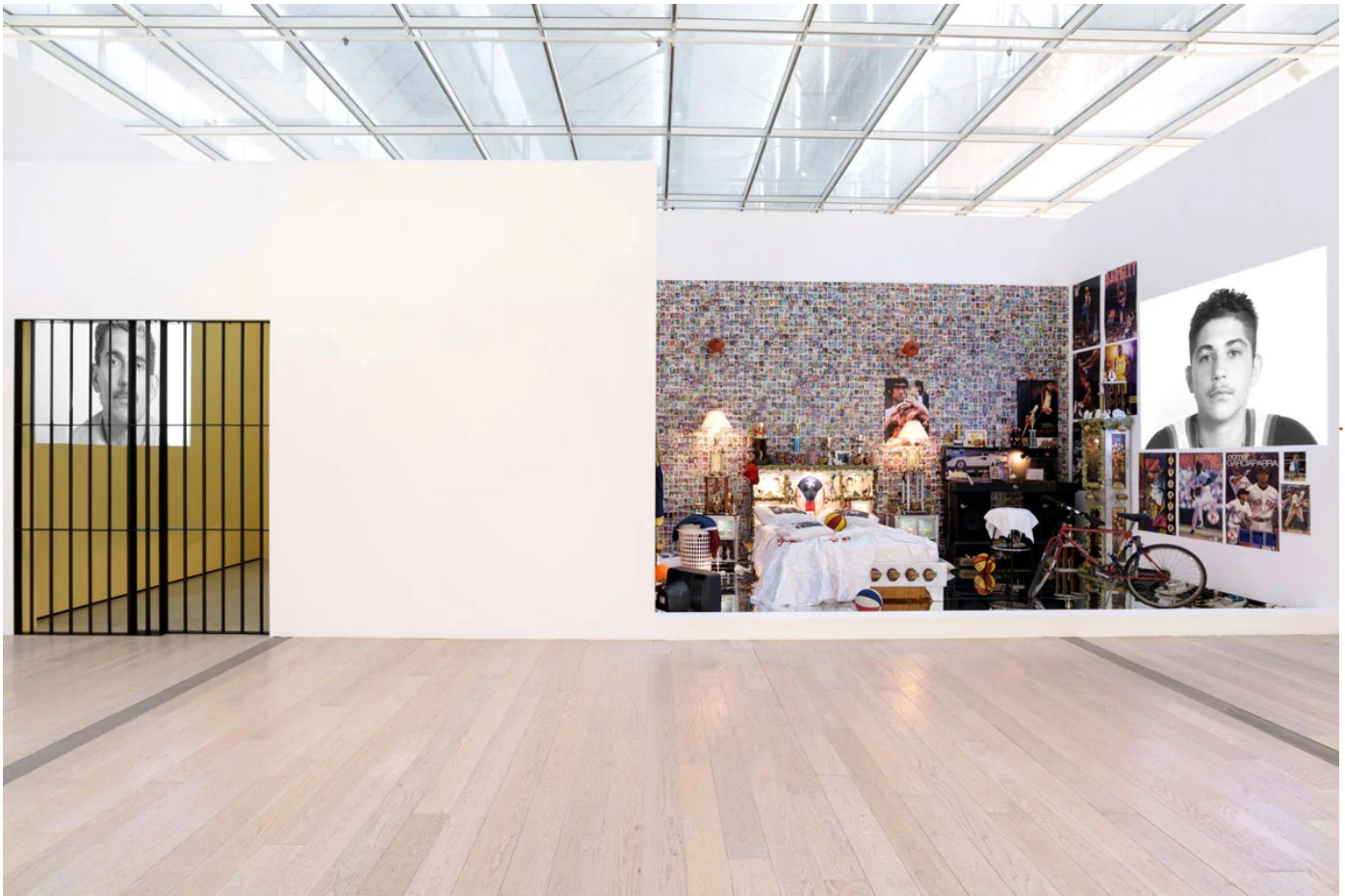
Pepón Osorio, Badge of Honor , 1995, installation view at Los Angeles County Museum of Art, 2017.

(whose image is shown in a bedroom bedecked in classic '90s teen accoutrements). The conversation isn't imagined. Rather, it was a real one mediated by Osorio, who traveled between Northern State Prison in Newark, New Jersey, where the father was imprisoned at the time, and the son's home over the course of several weeks.