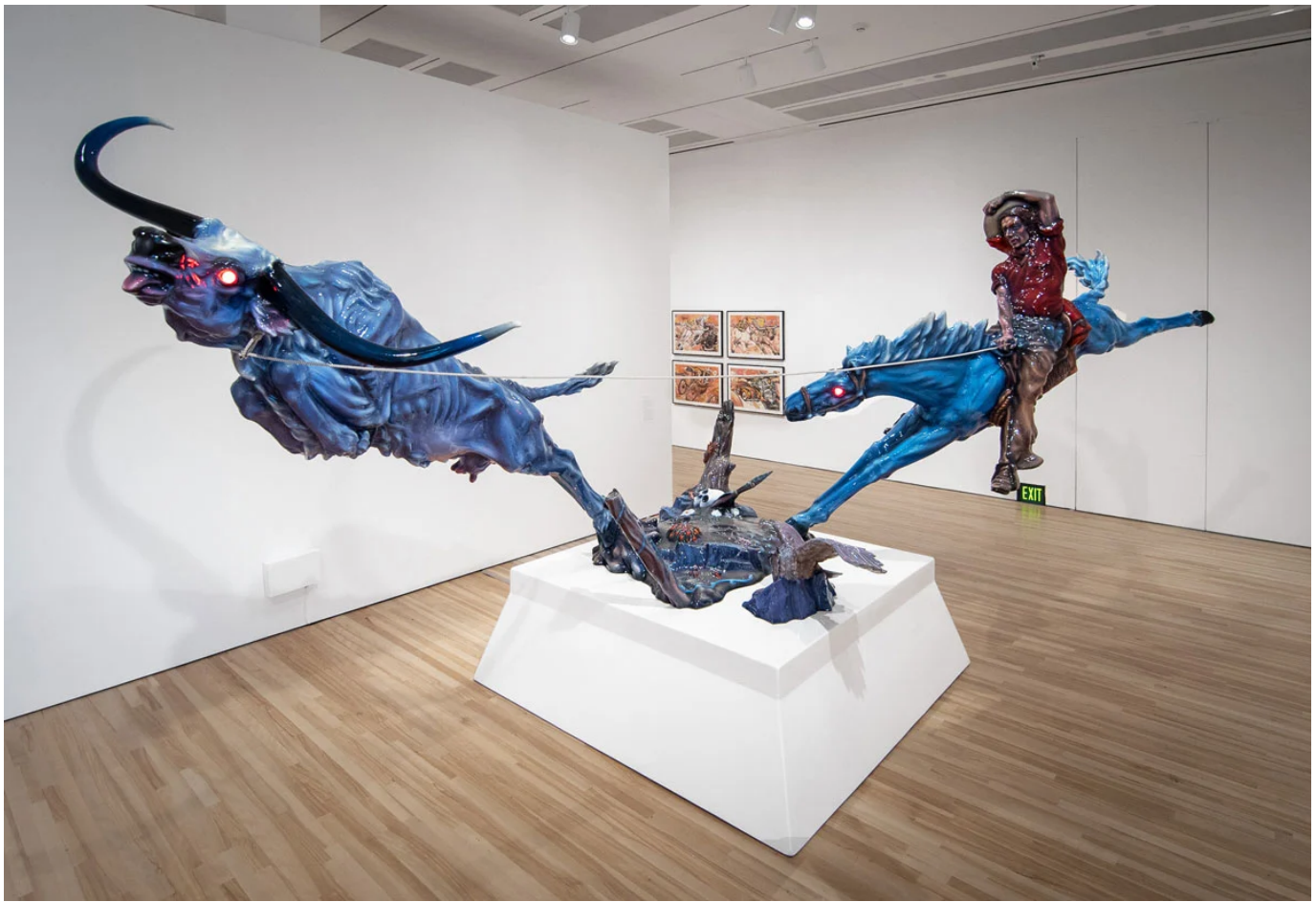
Installation view of “Border Vision: Luis Jiménez’s Southwest,” 2021–22, at Blanton Museum of Art, Austin.