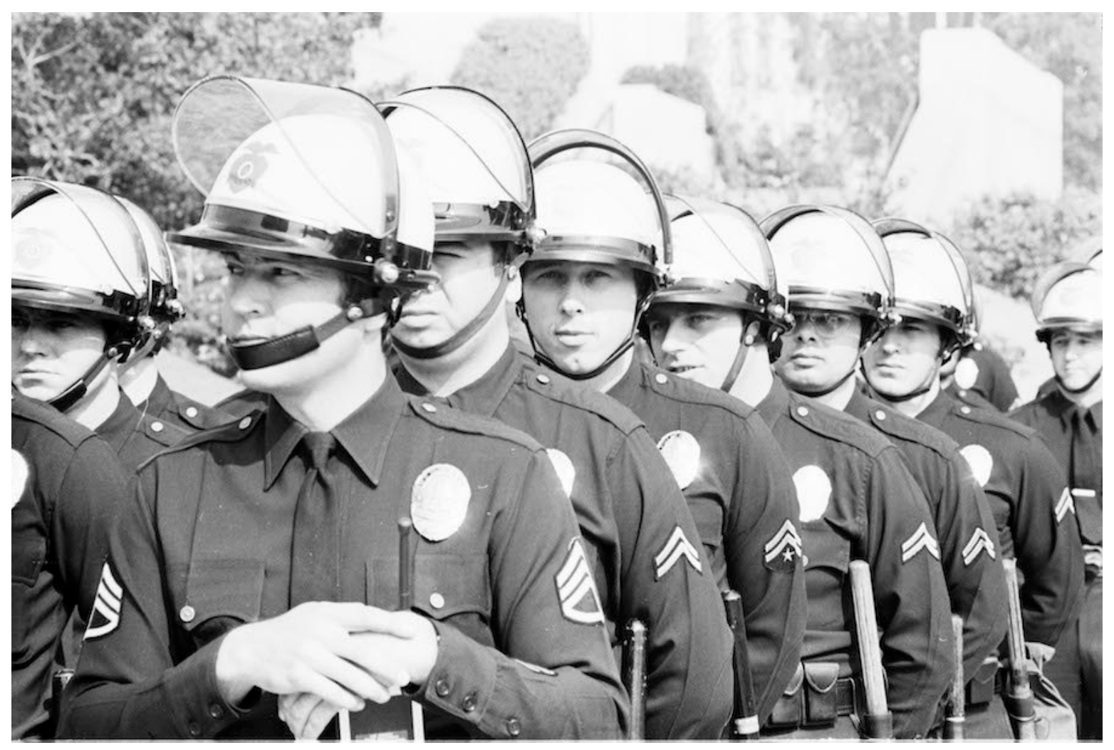
Raul Ruiz, L.A. Police officers at the Los Angeles Civic Center demonstration, circa 1970. Courtesy of the photographer and the UCLA Chicano Studies Research Center. © Raul Ruiz.

Some of the most compelling images are in "The Other, The State" section. Terrifying pictures of squads of police, lined up, often in riot gear tensely waiting for action, speaks volumes. On a personal note, it reminds me of the People's Park riot which I witnessed and where I saw police brutality up close for the very first time. Raul Ruiz captures a more relaxed police force in LA Police Officers at the Los Angeles Center demonstration circa 1970, which depicts the police lined up and ready to roll. The repetition of the uniforms moving back in a diagonal creates a memorable image.