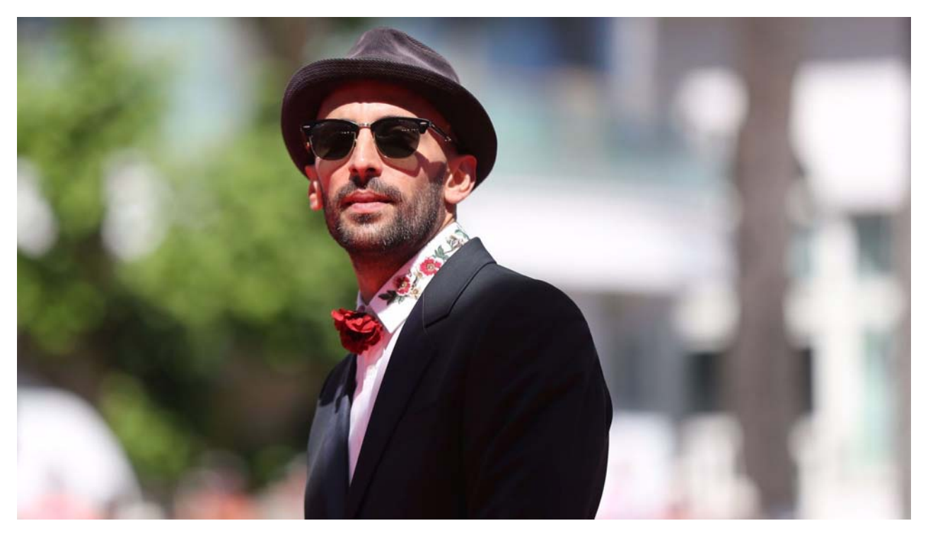
French artist and photographer JR posing as he arrives for the screening of the film he co-directed with Agnes Varda, "Faces, Places" (Visages, Villages), at the 70th edition of the Cannes Film Festival.

In orchestrating his artworks, he engages the local community — especially the marginalized and the elderly — for the creation of images, as well as their ultimate installation.