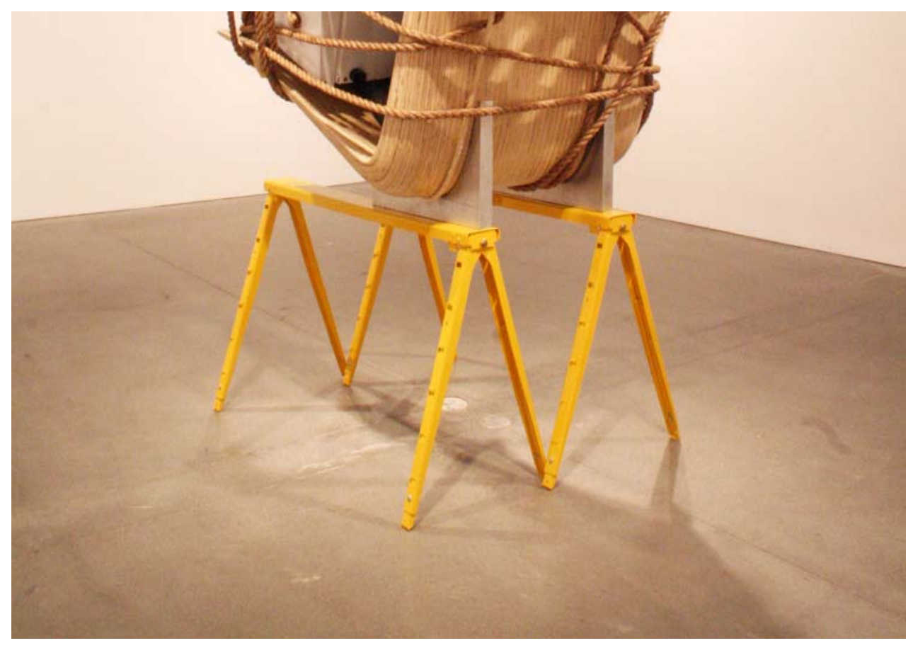
Camilo Ontiveros first made a version of "Temporary Storage" at UCLA in 2009, featuring all of his own belongings. (Camilo Ontiveros)