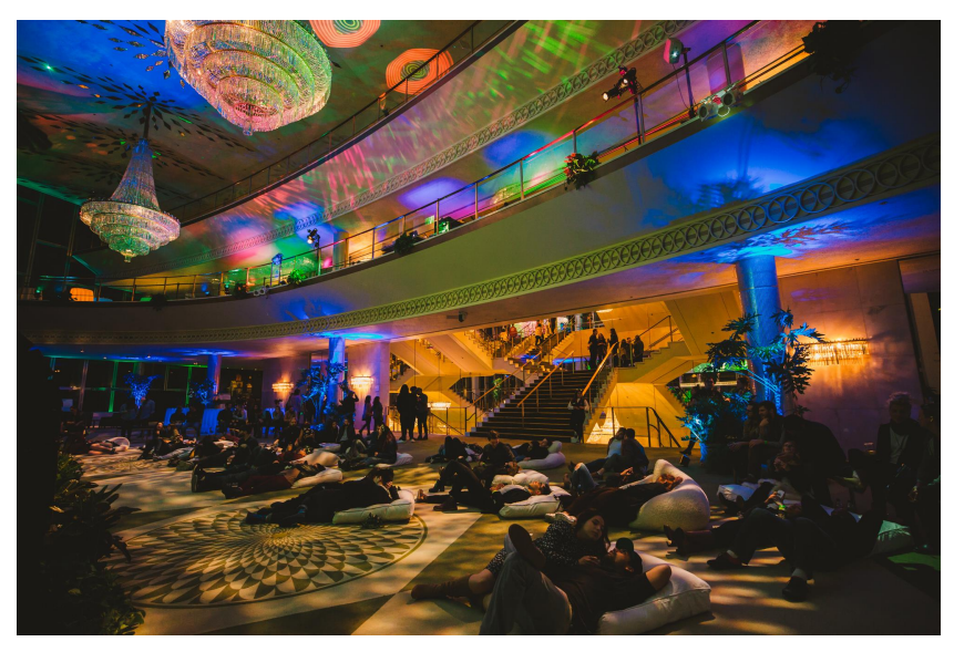
Sleepless: The Music Center After Hours

Tickets: Free and open to the public. More information here.