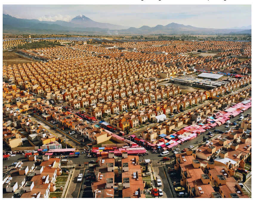
Livia Corona Benjamin, 47,547 Homes, 2009, courtesy of the artist and Parque Galería, © 2009 Livia Corona Benjamin