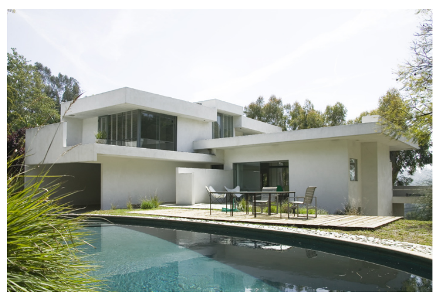
Fitzpatrick-Leland House (1936)

Tickets: Free and open to the public. More information here.