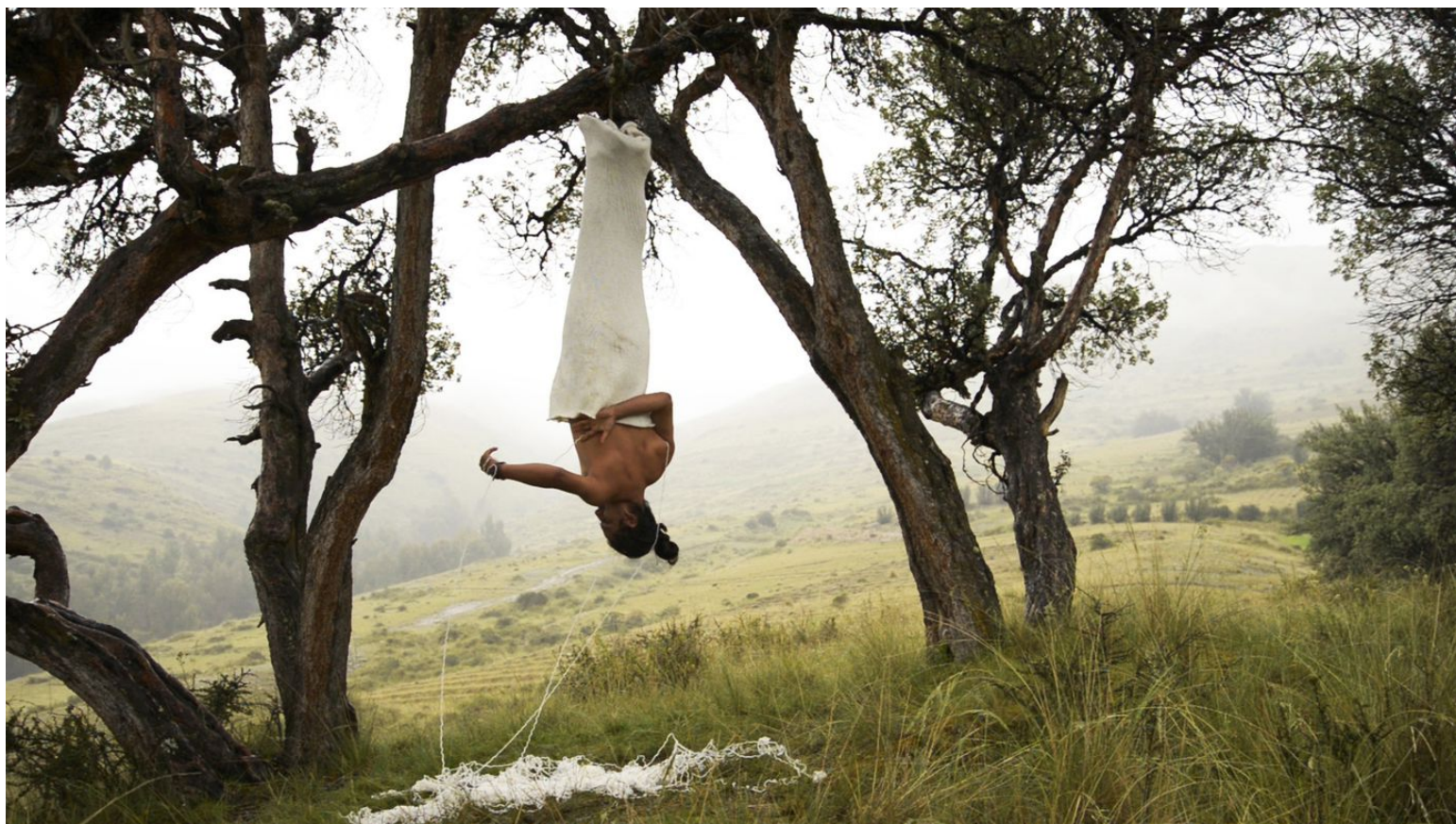
"Suspendido en un Queñua," 2014, by Antonio Paucar at the Museum of Latin American Art. (Antonio Paucar / Gallery Barbara Thumm)

"Gary Simmons: Fade to Black," at the California African American Museum. In a lobby installation — one that takes full advantage of its size and scale — Simmons pays tribute to forgotten African American actors and films. On a black background, the L.A. artist features the titles and names of films and individuals important to the early days of Hollywood history, but forgotten over time. Through July 2018. 600 State Drive, Exposition Park, Los Angeles, caamuseum.org .