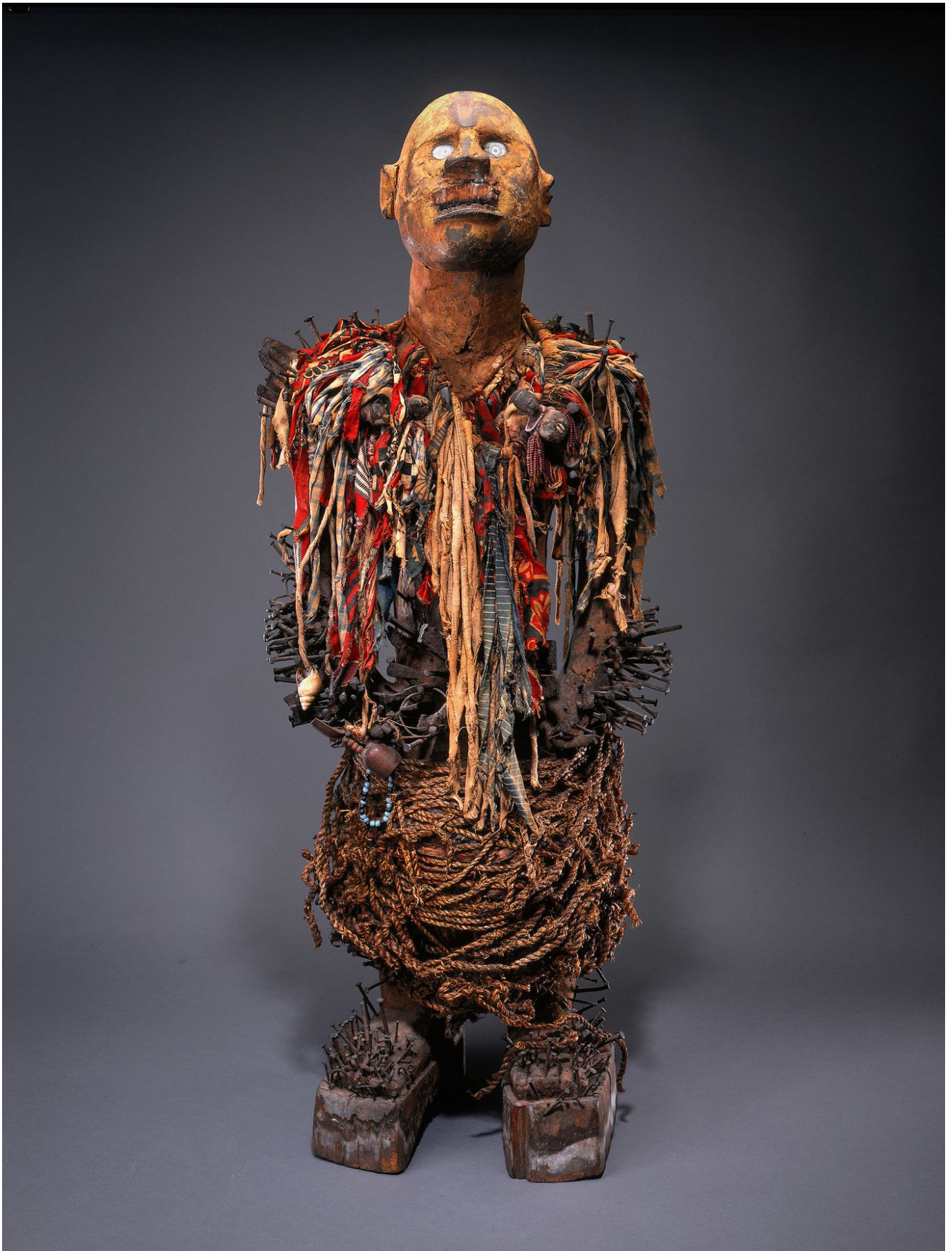
"Power Figure (Nkisi Nkondi)," 18th to 19th century, on view at the Fowler Museum.

latimes.com/entertainment/arts/miranda/la-et-cam-datebook-jonathan-lyndon-chase-20180531-htmlstory.html