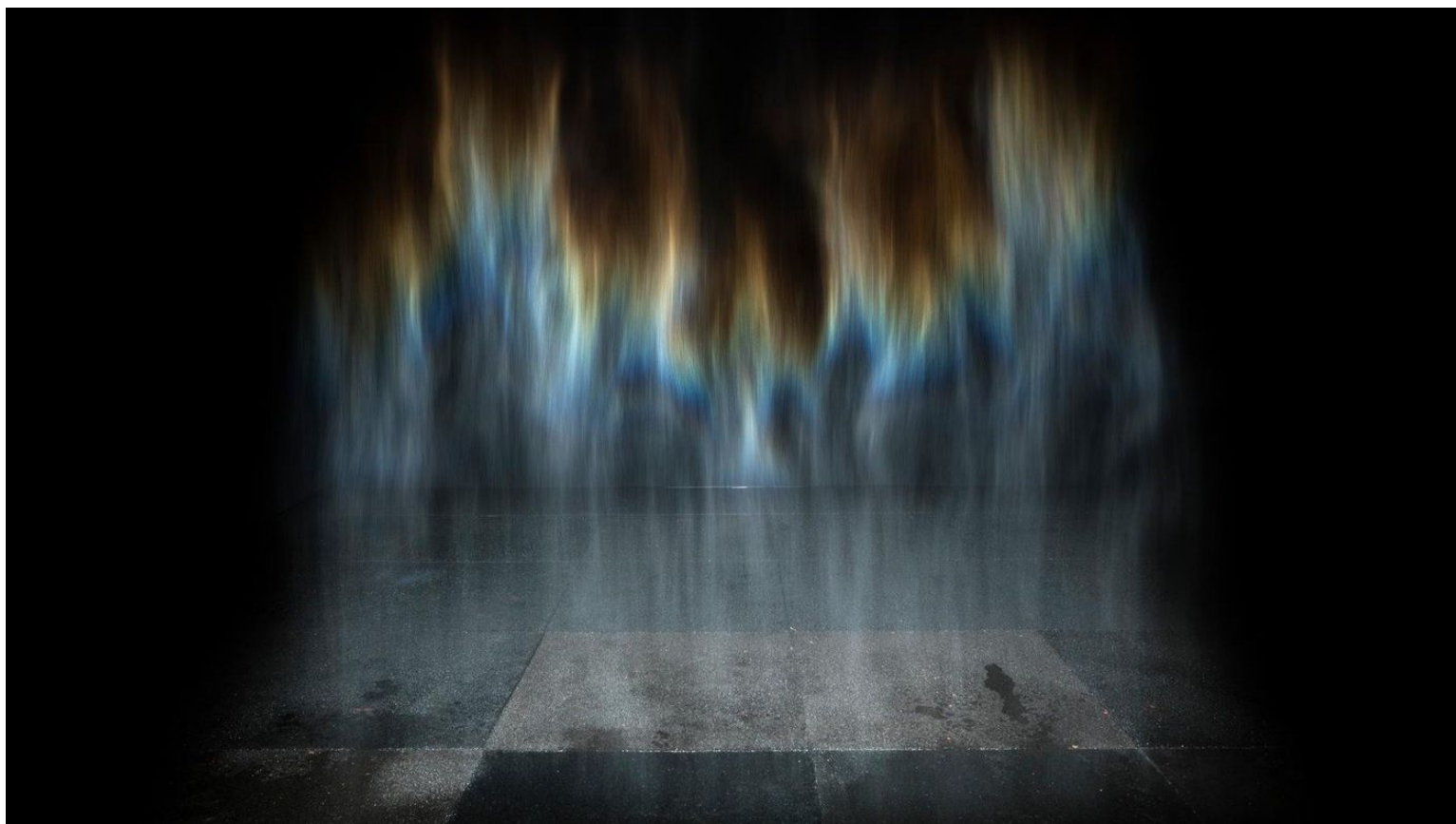
"Beauty," 1993, by Olafur Eliasson at the Underground Museum.