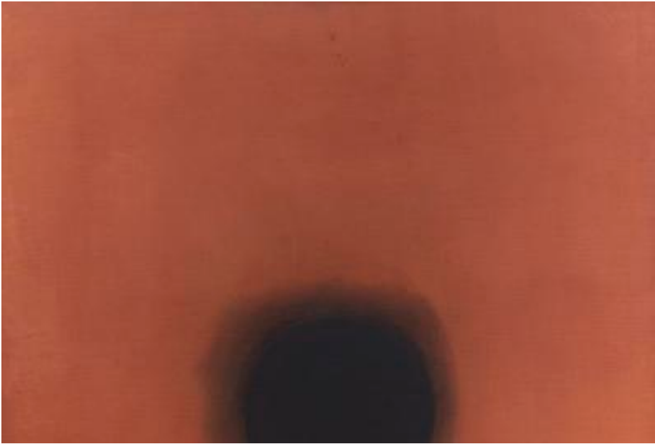
Abstract by Nature: Paintings from the 1950s to the Present, A Southampton Exhibition Featuring Masters of Abstract Expressionism, Color Field Post-War Art and Contemporary Artists