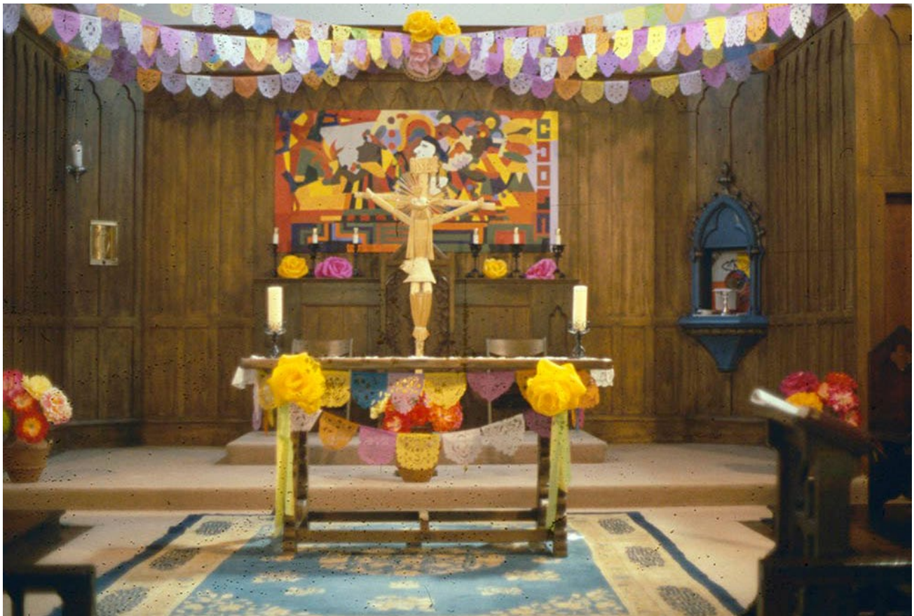
An 1968 photo of the altar at the Church of the Epiphany in Los Angeles, from the La Raza Photograph Collection

“It was a very special place because it wasn’t conservative, but yet they had the gospel that said we had to act,” she added. “We had to be active on behalf of our brothers and sisters. That became home for me.”