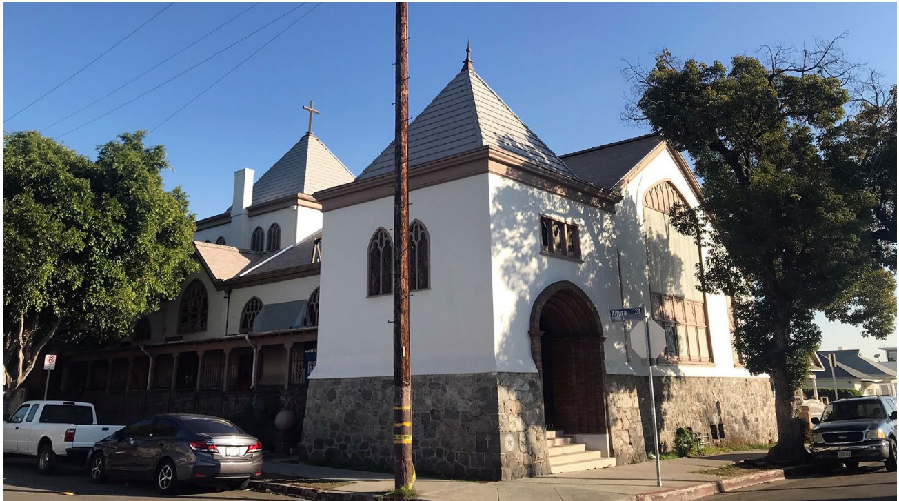
The Church of the Epiphany in the Lincoln Heights neighborhood of Los Angeles recently earned a spot on the National Register of Historic Places.

The Church of the Epiphany, founded in 1887, became a center for the flourishing Chicano movement in the 1960s. It's where activists organized around Robert F. Kennedy's presidential campaign. It's where leaders met to plan the East Los Angeles high school student walkouts protesting inequities in their schools, as well as the historic Chicano Moratorium against the Vietnam War draft. Labor leader Cesar Chavez gave speeches in the church hall. In later years, the church played a role in helping Central American refugees fleeing wars.