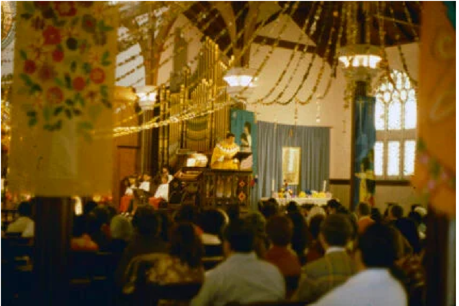
A service at the Church of the Epiphany in Los Angeles in 1968.

Funds are earmarked toward Epiphany's leaking basement, which was home to the Chicano newspaper La Raza and stores photos and documentation of the church's history. The money will also go toward protecting the archives, installing an elevator for ADA-compliant access, and creating meeting rooms for legal and health clinics. They also plan to update the heating and cooling systems.