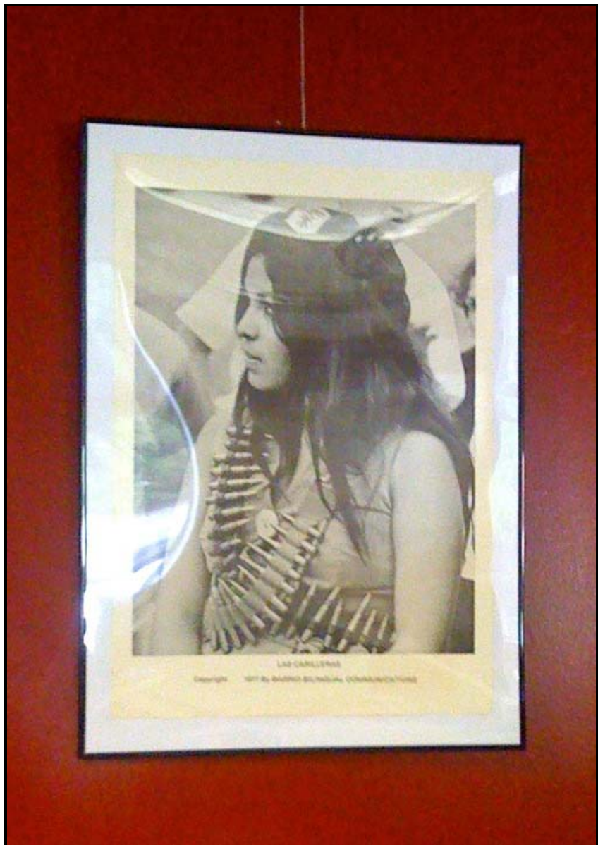
Barrio Bilingual Communications - "Las Carilleras" 1977

The next poster I was pleased to view in persona from Chican@s (re)Imagining Zapata was Barrio Bilingual Communications - "Las Carilleras" , a thought provoking image of a Chicana draped in artillery ammunition, who looks prepared to fight por la causa . Although my favorites had to be the El Taller Gráficos , Black and Red United Farm Worker posters. Which contained images of Mexican heroes, Francisco 'Pancho' Villa and Emiliano Zapata .