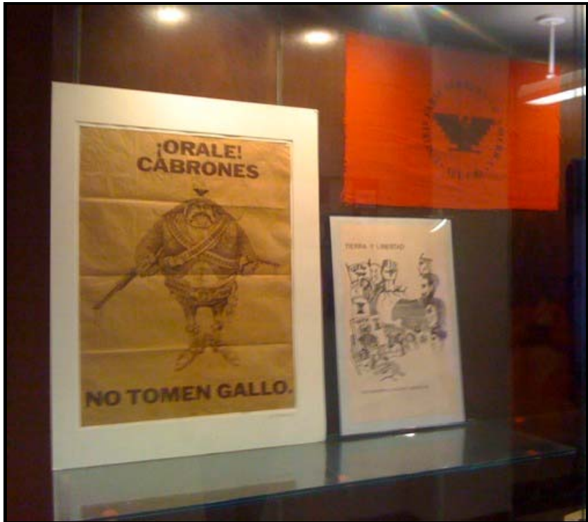
Display case at the entrance to UCLA CSRC Library showcasing UFW pieces from Chican@s (re)Imagining Zapata exhibit.

CHICANO ART MOVEMENT ATTENDS: CHICAN@S (RE)IMAGINING ZAPATA @ UCLA CHICANO STUDIES RESEARCH CENTER LIBRARY