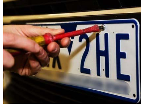
California Launches New Policy for Cars Used Less Than 50 Miles/day EXPERTS IN MONEY