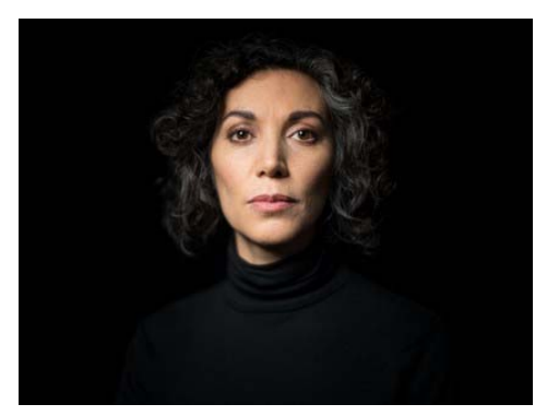
People Who Retire Comfortably Avoid These Financial Advisor Mistakes