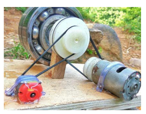
12x Better Than Solar Power? Prepper Invention Takes Country by Storm EZ ELECTRICITY