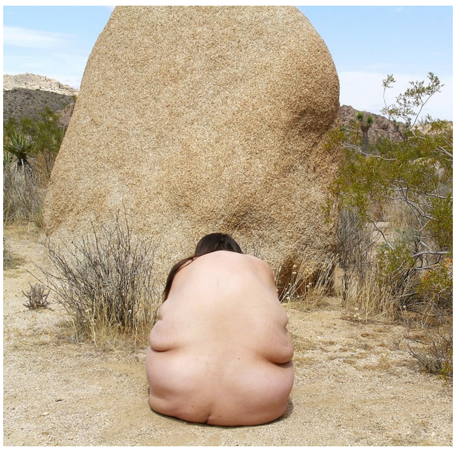
Laura Aguilar, Grounded #111, 2006/2016

Arguably, this is nowhere more poignant than in Aguilar's work with her own body. A decade's worth of these photos has its own room in the gallery, where viewers are given nearly 360 degrees of both black-and-white and color depictions of Aguilar's voluptuous figure framed by trees, boulders, creeks, and desert. Often she is laying down or kneeling, at times with other women's bodies but mostly alone, her own curves and crevices echoing the lines of the natural world around her.