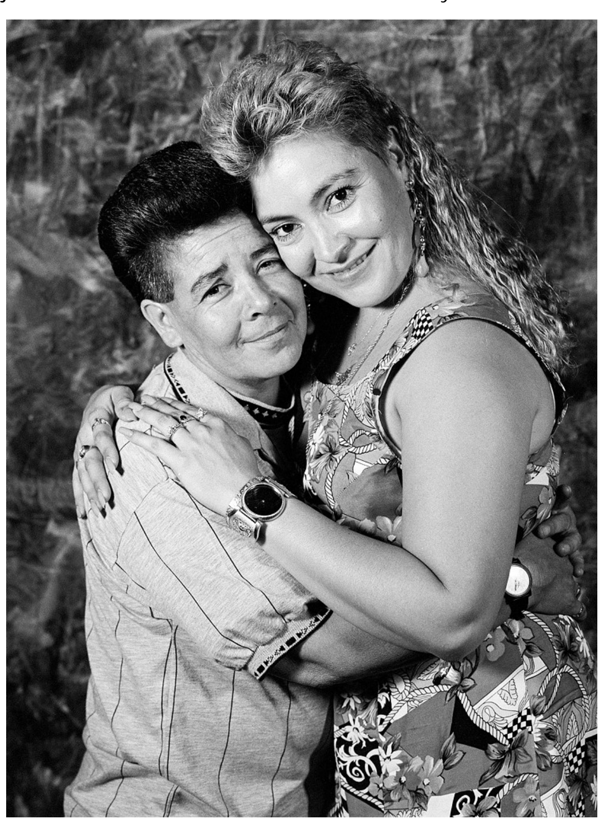
Laura Aguilar, Plush Pony #15, 1992