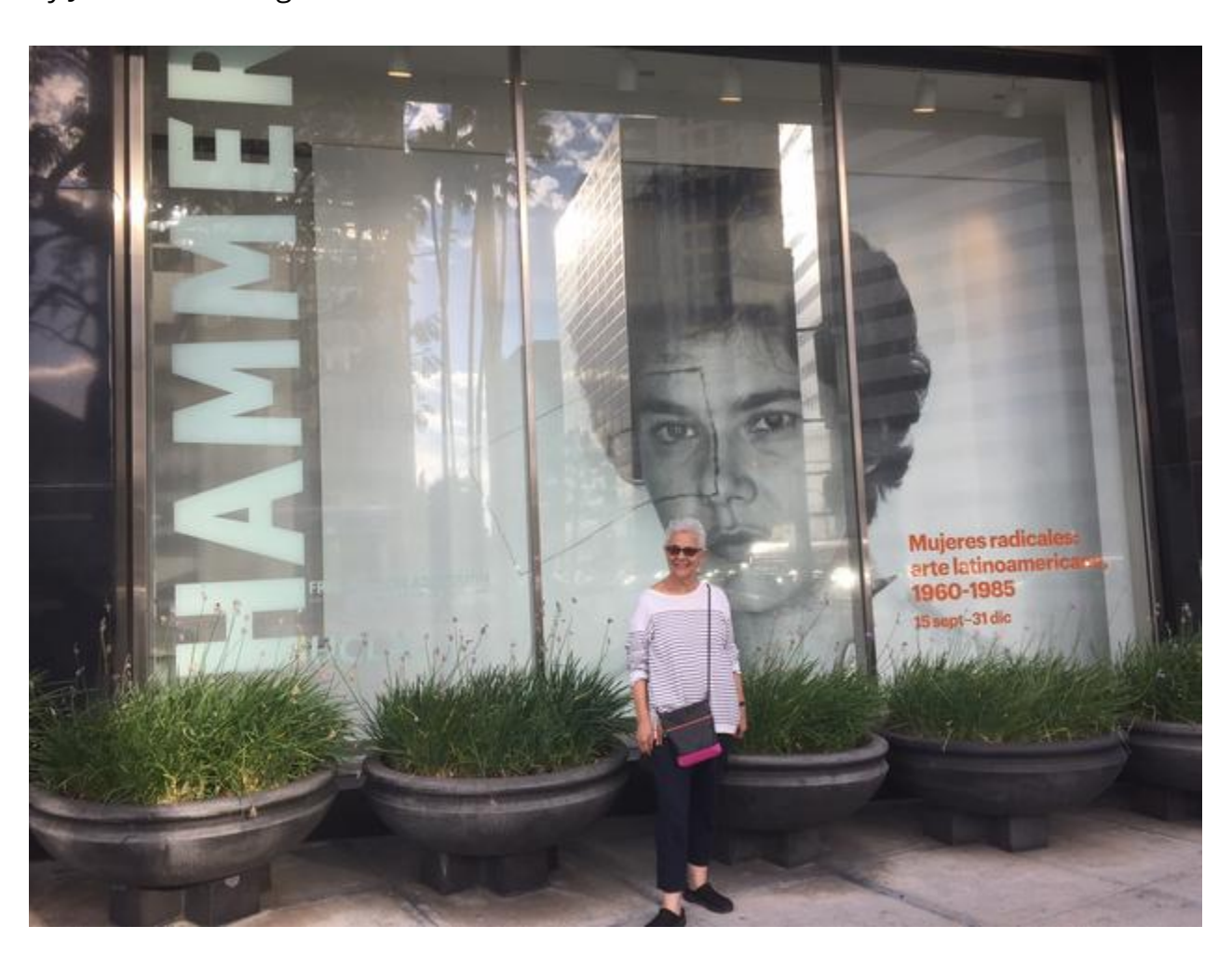
By Julia P. herzberg

From this post, the fifteenth, I will publish a series of images in the form of photo essays that impressed me during my visits to museums during the inaugural week September 11-17