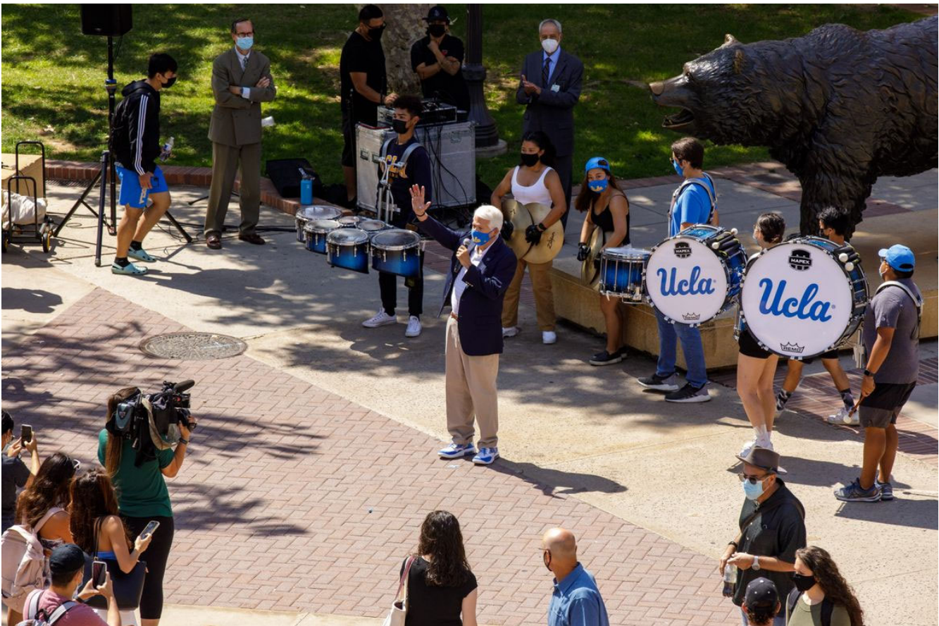
Chancellor Gene Block surprises UCLA students on Bruin Plaza on the first day of class in the fall 2021 quarter.