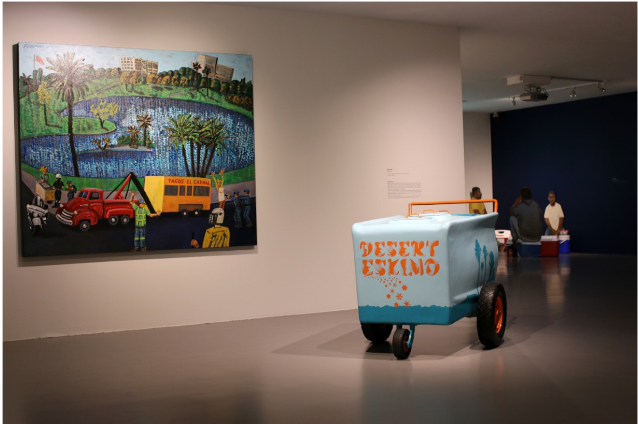
"MacArthur Park, the Arrest of the Taco wagon, an Attack on Culture" 2010 by Frank Romero and "Paleta Cart," 2004 by Gary Garay