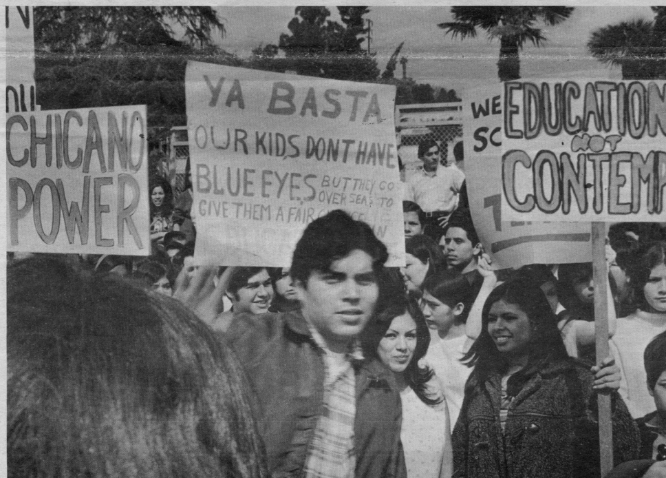
Page 1 of the Chicano Student News , March 15, 1968 (vol. 1, no. 1). La Raza Newspaper and Magazine Records , CSRC Library Special Collections.