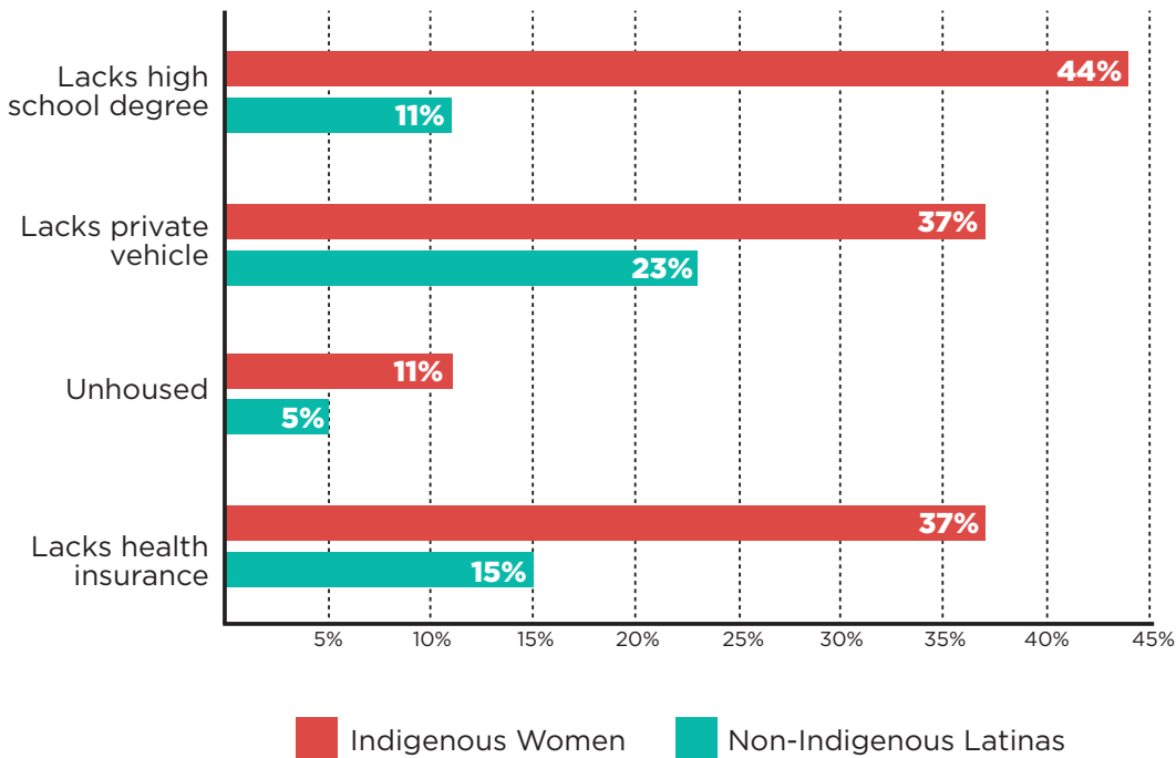
Figure 1. Economic Challenges Experienced by Indigenous Women and Non-Indigenous Latinas, Ages 18-34

Latinas in Oxnard encounter a range of alarming economic, health, and economic challenges that limit their ability to thrive, and those with Indigenous family origins face even greater obstacles. To begin, many Indigenous women lack the opportunities to attend or complete formal schooling. Consequently, as figure 1 illustrates, 44% of Indigenous women, compared to 11% of non-Indigenous Latinas, do not have a high school degree. Along with this educational deficit, Indigenous women encounter a range of other challenges. For example, 37% of Indigenous women lack access to a private vehicle, thereby limiting their ability to secure jobs and access resources. Furthermore, approximately 1 in 9 reported being unhoused, and two-thirds experience housing insecurity, meaning that they reported difficulty meeting