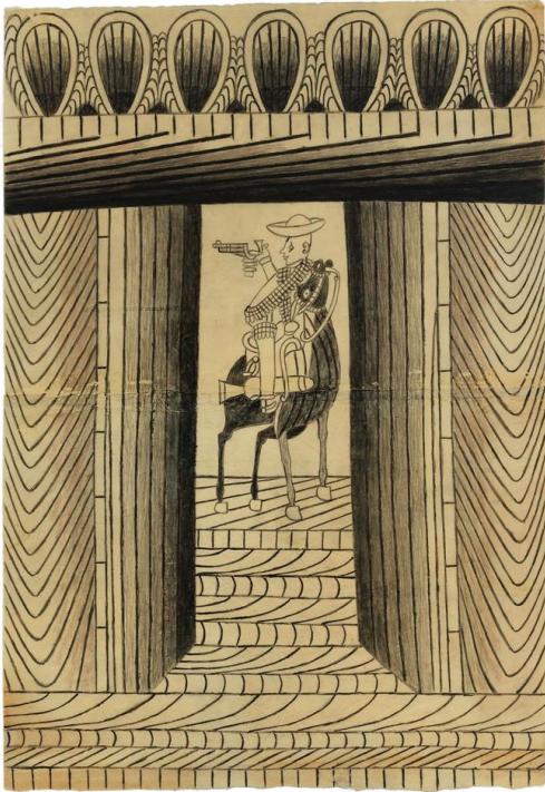
Martín Ramírez's 'Untitled (Horse and Rider With Frieze)'