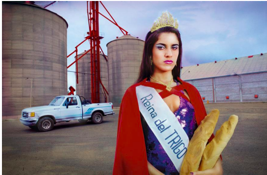
Marcos López 'La reina del trigo. Galvez, Provincia de Santa Fe' ('Queen of Wheat. Galvez, Santa Fe Province'), 1997, print 2017

Just how Brobdingnagian is this PST? It consists of 80 exhibitions rolling out during September at 70 venues in a 120-mile radius from downtown L.A., and will result in 60 catalogs. The chronological span reaches from pre-Columbian treasures to performance art from, well, right now. The ethnic spread includes Chinese artists living in the Hispanic Caribbean and racially Japanese artists residing in Lima. Exhibition topics include the U.S.-Mexican border (“Bridges, not walls” might as well be offered as a free tattoo at every show), whether craft can be fine art, and queerness among Chicanos. (A language note: “Chicanos” seems to have made a comeback as a designation for Americans of Mexican descent, but the wannabe trend to de-gender the likes of “Latina” and “Latino” with “Latinx”—pronounced “Latinex”—gains little footing in PST.)