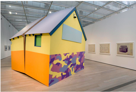
Daniel Joseph Martinez's full-scale reprise of the Unabomber's cabin, 'The House that America Built' (2004-17)

gallery fare from today. The same tale of conquest/exploitation/resistance and social comment with a certain postmodern glamour to it is told in other PST shows, but—if you have the patience to stand and look at that many photographs on walls—the Getty's show tells it most fully.