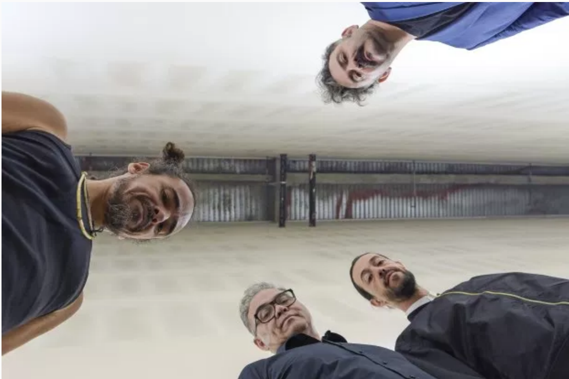
Cafe Tacuba joins La Santa Cecilia and Mon Laferte at the Hollywood Bowl to celebrate Pacific Standard Time: LA/LA on Sunday, Sept. 17.

While the exhibitions focus on the visual arts, PST: LA/LA programs also touch on film, music and the performing arts.