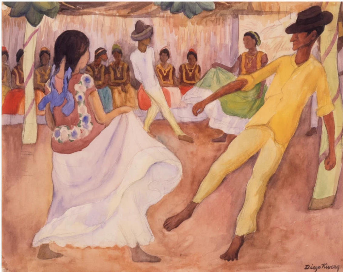
Diego Rivera's Dance in Tehuantepec is featured in the Skirball Cultural Center's homage to Anita Brenner, the journalist who introduced Mexican art and culture to U.S. audiences.