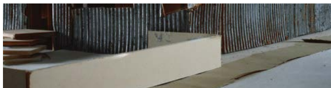
September 10, 2015 Gehry, Gehry, Gehry: the architect's retrospective opens at LACMA on September 13