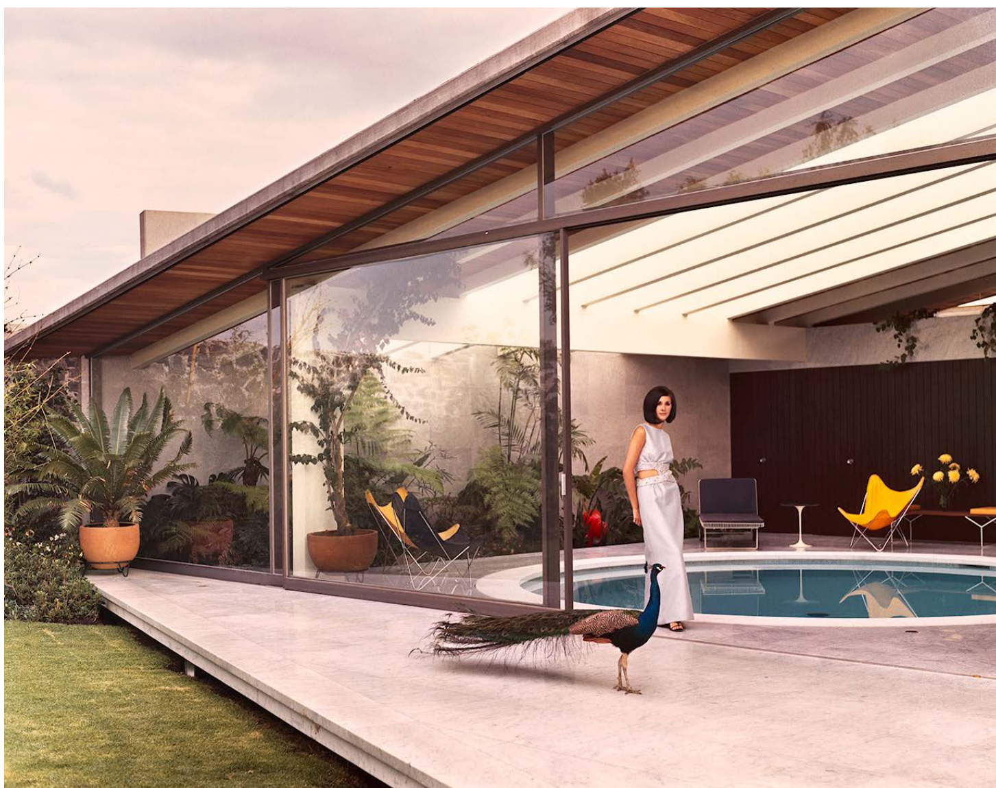
Image from Found in Translation: Design in California and Mexico, 1915–1985 exhibition showing Residence in El Pedregal de San Angel by Francisco Artigas and Fernando Luna. (Courtesy Fernando Luna / PST:LA/LA)