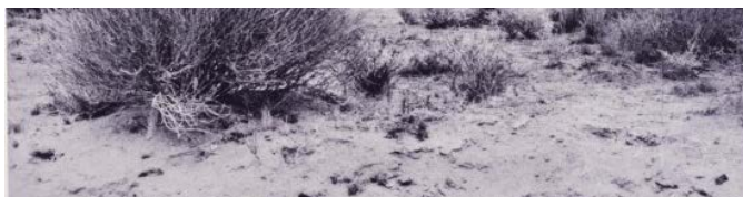
January 7, 2016 Desert X to bring the art fair circuit to Coachella Valley