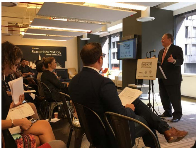
September 20, 2016 Grand Central Tech inaugurates new space for urban-focused startups