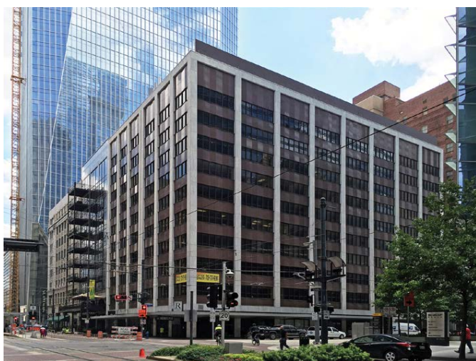
September 20, 2016 Two hotel rehabs illustrate evolving attitudes about preservation in Houston