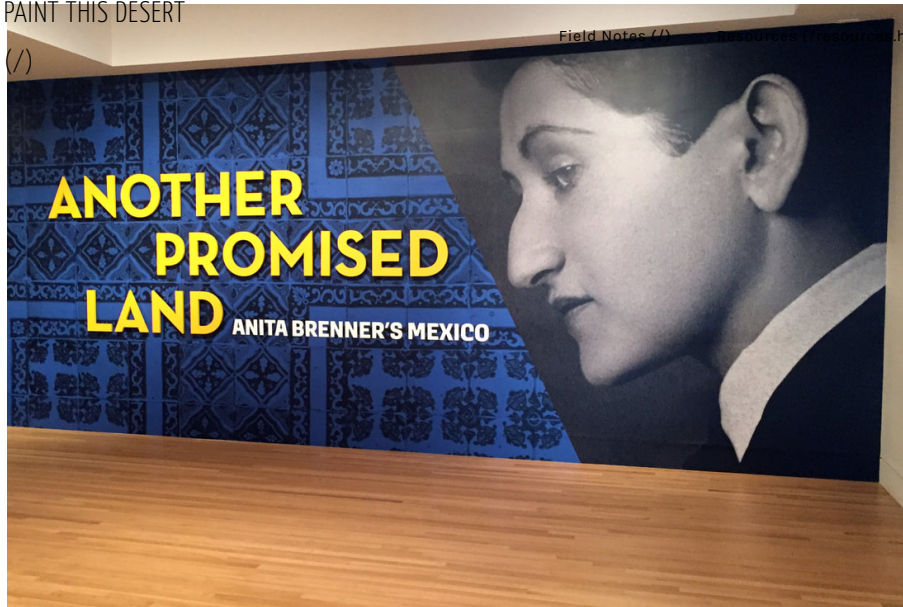
Skirball Cultural Center graphic for "Another Promised Land: Anita Brenner's Mexico" with 1926 photo of Anita Brenner by Tina Modotti.

It was fitting that the final stop on the same shuttle was at the Autry Museum of the American West for "La Raza," named after the newspaper, which later expanded into a magazine, that was alternative press with low-budget graphics and powerful photojournalism that documented and empowered the Chicano movement. The exhibition is anchored by an interactive viewing station that allows black and white photographs to be studied and reviewed with the touch of a finger. It gives the space a fellowship between low- and high-tech use of document-as-art medium and activism.