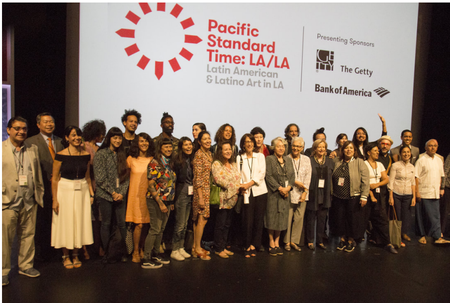
Artists and curators featured in Pacific Standard Time: LA/LA stand as a group at the Getty Center on Tuesday. Photo Ed Fuentes

0 Comments ( //www.paintthisdesert.com/field-notes/pst-lala-its-about-time#comments )