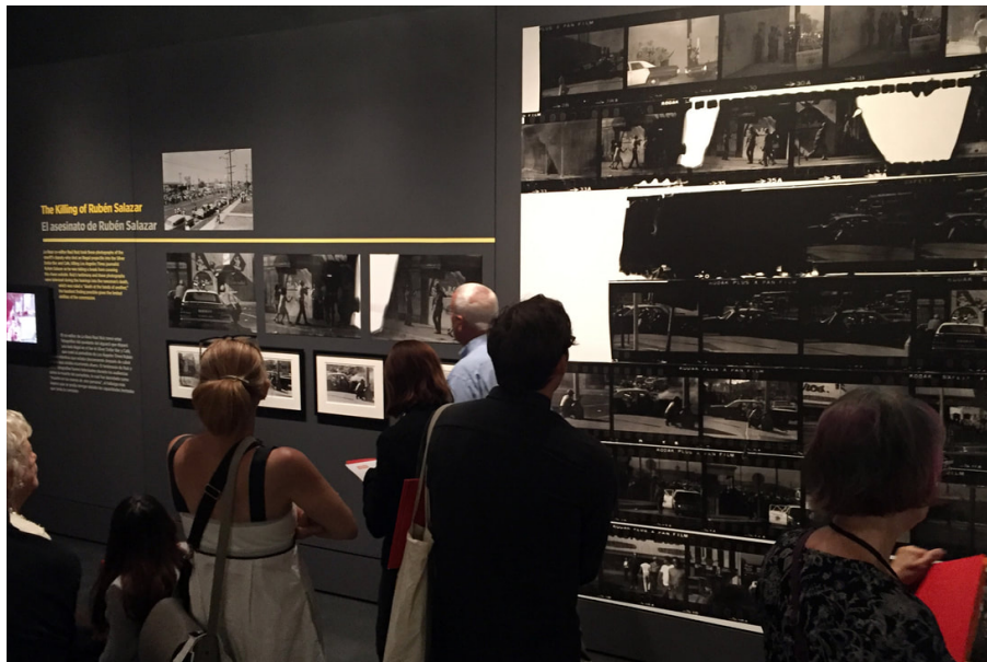
"The Killing of Ruben Salazar" wall at "La Raza" exhibition in the Autry Museum of the American West.

The centerpiece may very well be the enlarged frame of shots taken in front of the Silver Dollar Cafe, during the moments that, it was later learned, occurred before and after Los Angeles Times reporter Ruben Salazar was slain by an L.A. County Sheriff's deputy. Patches of overexposure in the photographs almost eradicate frames of time, a sequence that if lost shows the fragility of truth.