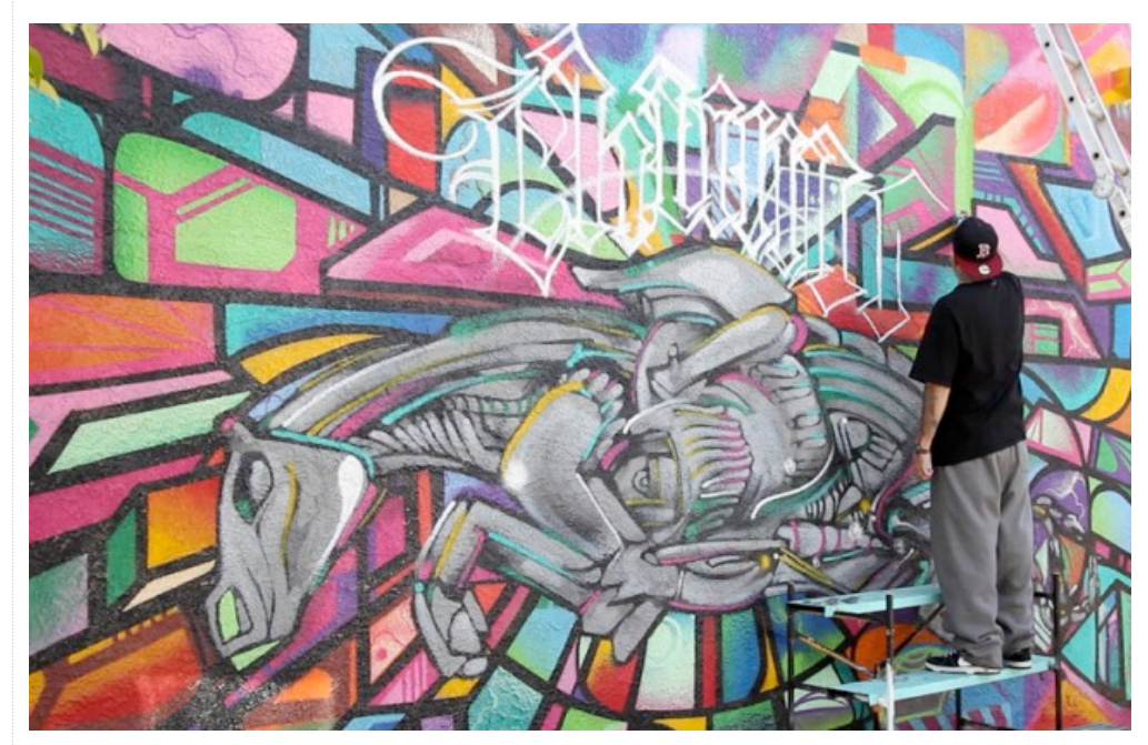
Big Sleeps

Over in West Hollywood at Prism Gallery was a show that has recently ended but received a lot of recognition.