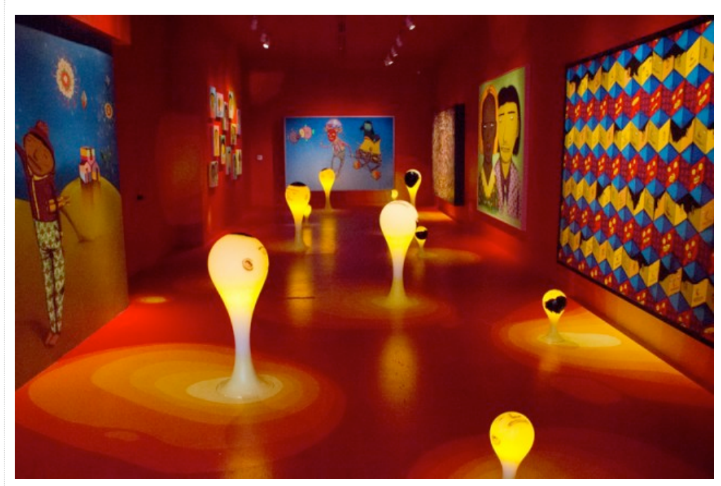
Os Gemeos "Miss You" at Prism

Os Gemeos are Brazilian twin brothers Gustavo and Otavio Pandolfo from Sao Paolo who received a lot of attention from MOCA's Art in the Streets exhibition last summer. Miss You was the brothers first solo show at this gallery. As I entered into the large space covered in red paint, I was pulled into a world of fantasy and magical realism. The exhibition consisted of large-scale paintings and sculptures, giant murals on the walls of the stairway, yellow light bulbs with faces painted on them bulging out of the floors and an interactive projection room that takes you into a surreal dream.