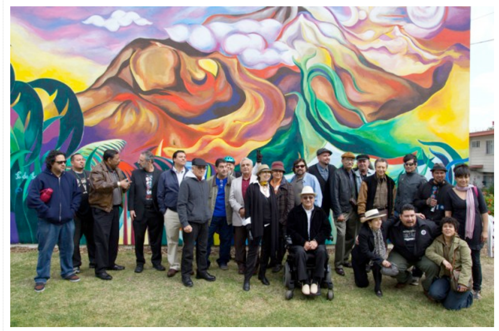
The mural community welcomes back "Organic Stimulus"