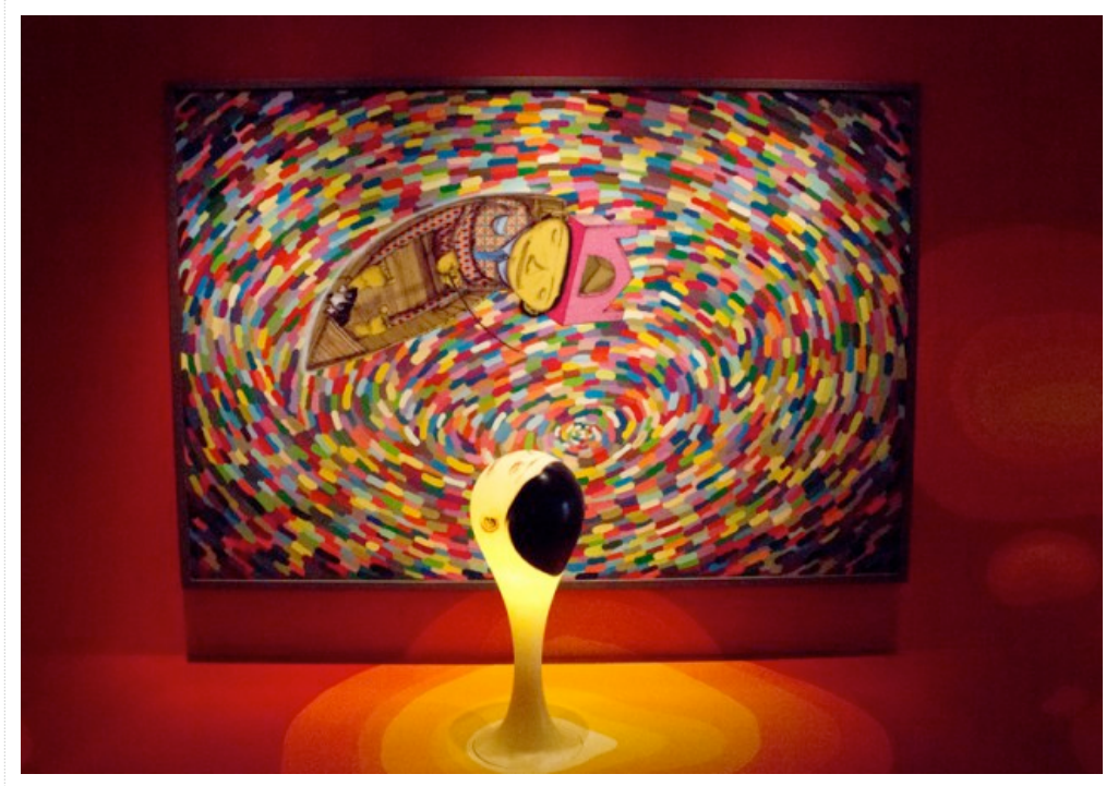
Os Gemeos "Miss You" at Prism