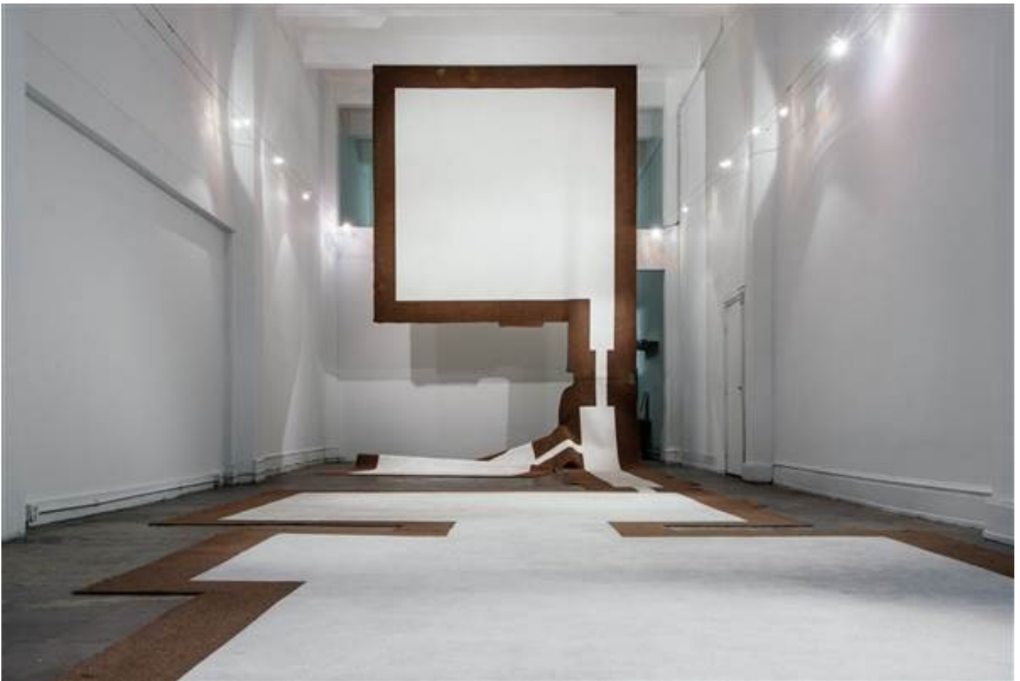
"Household Mutations" by Carmen Argote is on view at an exhibit called "Home--So Different, So Appealing: Art from the Americas since 1957," at the Los Angeles County Museum of Art. Courtesy of Carmen Argote

Liliana Porter, whose work is featured in “Rebel Women,” says, that an event like PST can open doors. “Not only through communication with the rest of North America, but with ourselves and the different American cultures.”