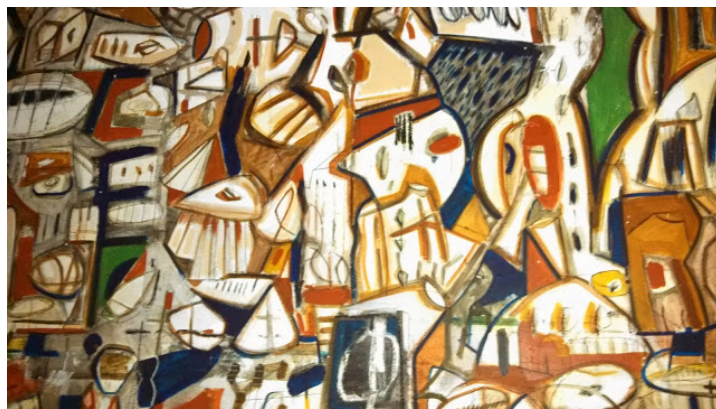
A Gronk wall.