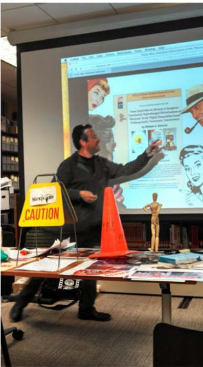
Elegance in motion.