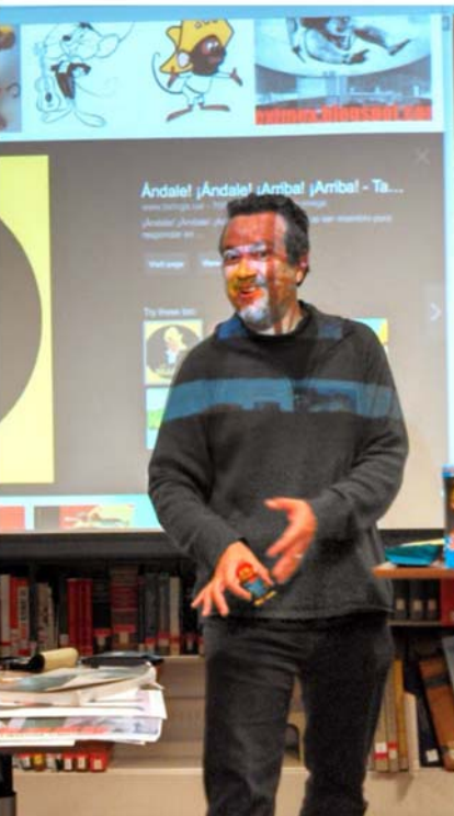
More visual aids.