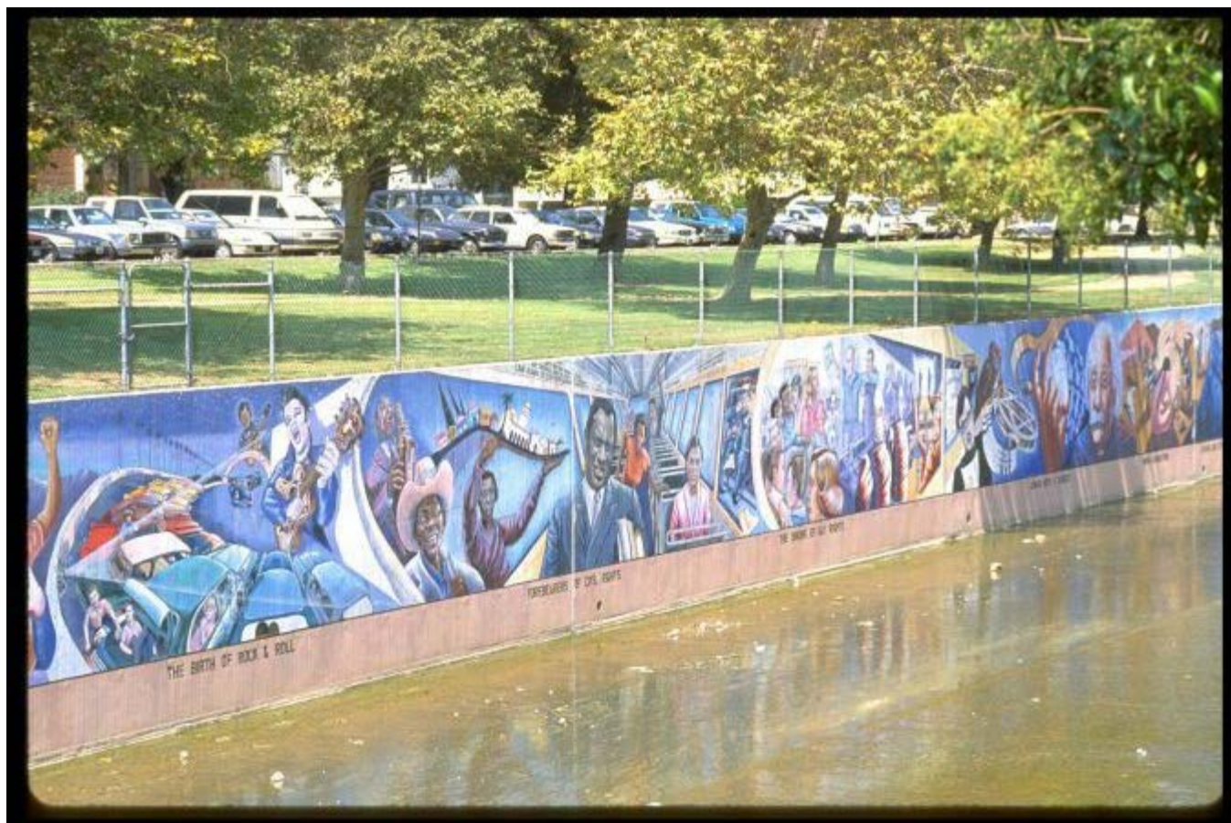
A portion of The Great Wall of Los Angeles

point for finding out more about the amazing women who've shaped the cultural production of this city — and will continue to make ways through both new work and the legacy they leave behind.