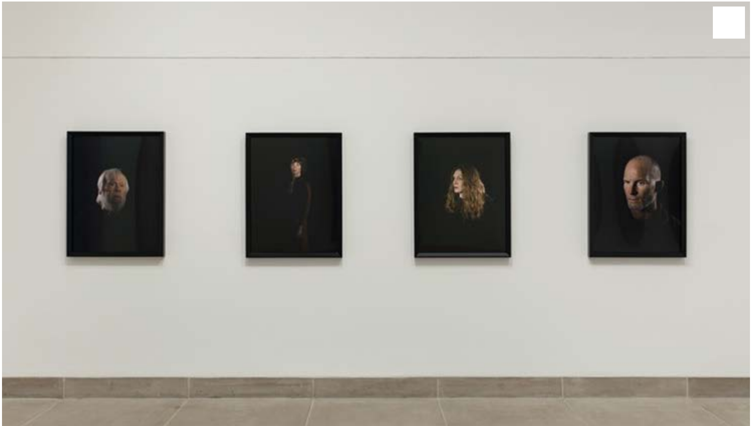
Installation view, Hammer Projects: "Catherine Opie: Portraits," Jan. 30-May 22, 2016, Hammer Museum, Los Angeles.

As one of the most important black artists in contemporary art history, Betye Saar has an especially important link to L.A.'s art history. She spent time at the Brockman Gallery, "one of the first galleries opened by members of the black community in L.A.," as she told L.A. Weekly back in 2011 . At 90 years old, Saar shows no signs of stopping , with international shows planned. Angelenos will get to see her work at the Craft & Folk Art Museum in an exhibition titled "Betye Saar: Keepin' It Clean," opening May 28. Saar's influence is difficult to capture succinctly: She continues to serve as an important artist working through themes of violence, memory and history through the lens of black culture.