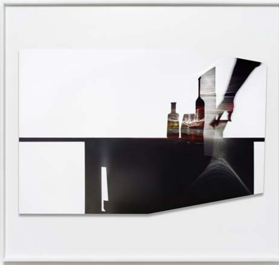
Uta Barth, In the Light and Shadow of Morandi (17.01) , 2017; face mounted, raised, shaped, archival pigment print in artist frame, 48¾ x 52¾ x 1¾ inches (framed); edition of 6, 2 APs.