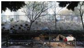
Lopez: Setting self-doubt aside to fix L.A. eyesore