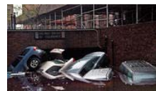
Photos: Super storm Sandy lashes East Coast

One of Latin America's top entertainment personalities is holed up in his dressing room at Univision's studios as frenzied fans just outside line a red carpet where celebrities