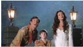
Television review: 'Mockingbird Lane' an uneven monster mash-up

are slowly making their way into the big show. As he quietly watches the procession on his dressing room monitor, his longtime assistant begins the intricate ritual of preparing his pre-show meal that includes branzini fish with rocoto chile paste and a tossed salad.