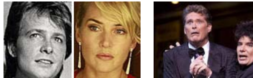
Timeline: Emmy winners through Celebrity meltdowns the years