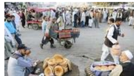
Farewell to Afghanistan, with sadness and affection