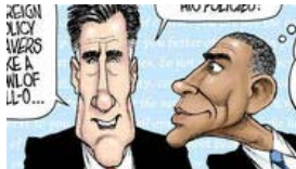
Slideshow: David Horsey political cartoons