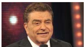
Photos: A history of 'Sabado Gigante' guests: From Pele to Bill Gates