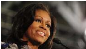
Michelle Obama encourages early voting on 'Jimmy Kimmel Live'