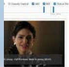
the latest fall TV