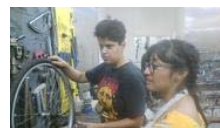
Holland: Not all about bikes at 'Bicycle Bitchen'