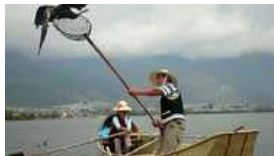
Yunnan, China's hidden gem