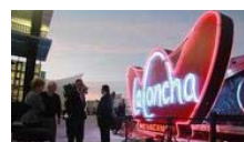
Museum illuminates old-school Vegas | Photos