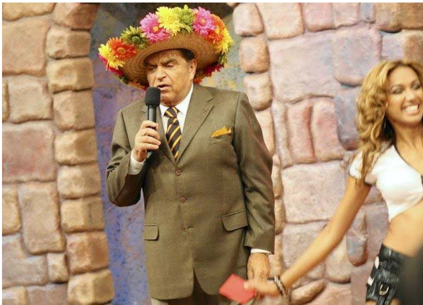
Don Francisco has hosted the Spanish-language show (which translates to "Giant Saturday") since 1962.