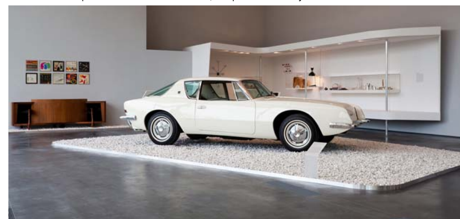
Installation view, California Design, 1935-1960, "Living in a Modern Way." Oct. 1, 2011 through March 25, 2012, Los Angeles County Museum of Art.

Where: LACMA | Total show attendance: 363,589 | Number of days on view: 210