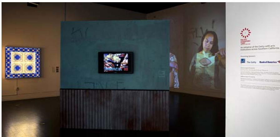
Installation view, "Mural Remix: Sandra de la Loza," Oct. 15, 2011 through Jan. 22, 2012, Los Angeles County Museum of Art.

Where: LACMA | Total show attendance: 83,078 | Number of days on view: 84