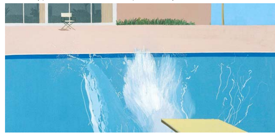
A portion of David Hockney's "A Bigger Splash," 1967, British, acrylic on canvas. Unframed: 242.5 x 243.9 x 3 cm (95

Where: Getty | Total show attendance: 143,180 | Number of days on view: 107