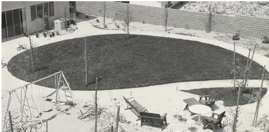
"Backyard, Diamond Bar, California" by Joe Deal. Gelatin silver print, Image: 28.4 x 28.6 cm (11 3/16 x 11 1/4 in.) Credit: © Joe Deal. The J. Paul Getty Museum, Los Angeles.

Where: Getty | Total show attendance: 130,571 | Number of days on view: 118