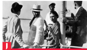
Never Forget Who Frida Kahlo Really Was