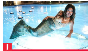
5 Latinas Discuss Cristela , Jane the Virgin , and Representation on TV