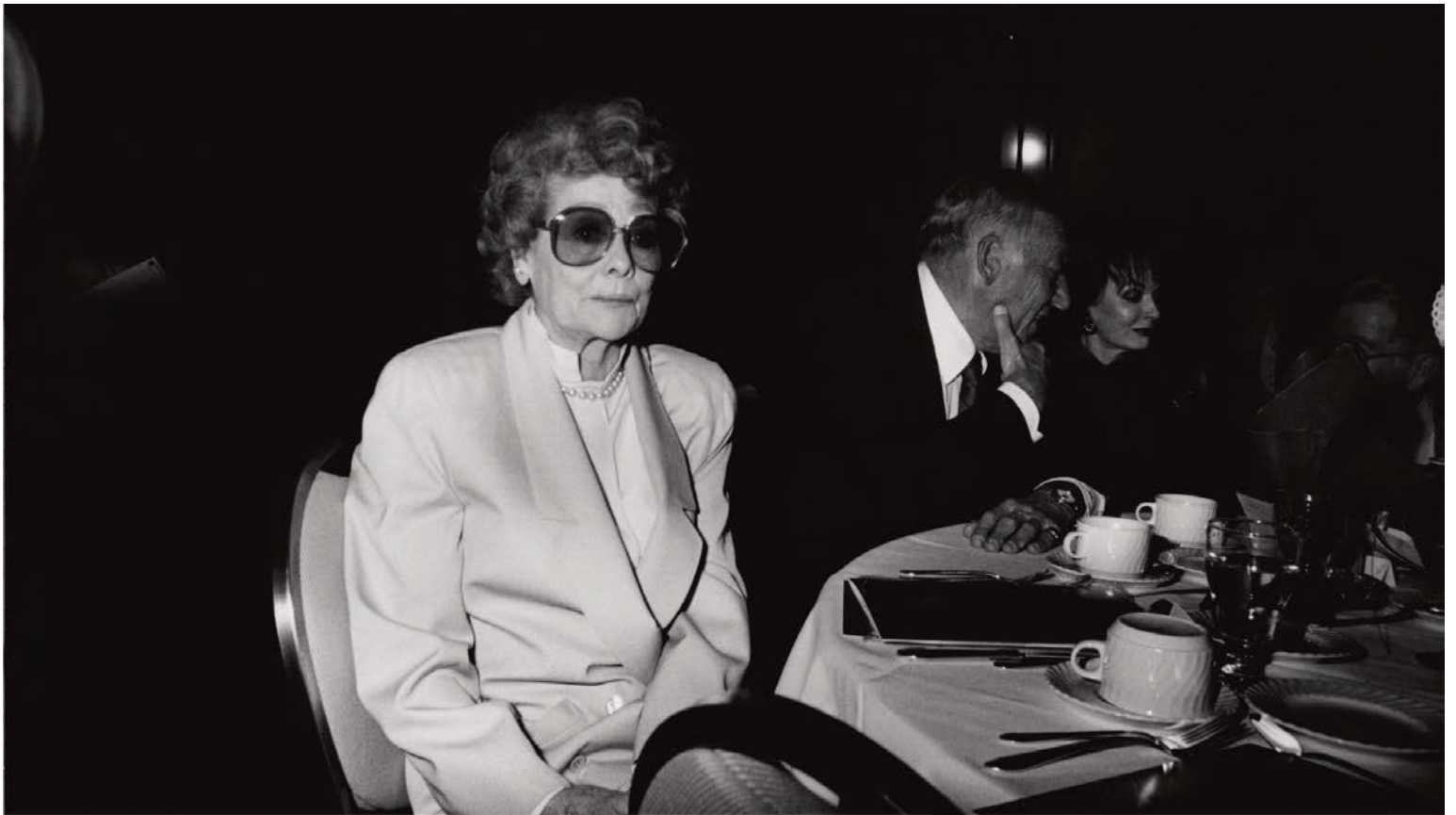
Lucille Ball at a Hollywood event in the 1980s.