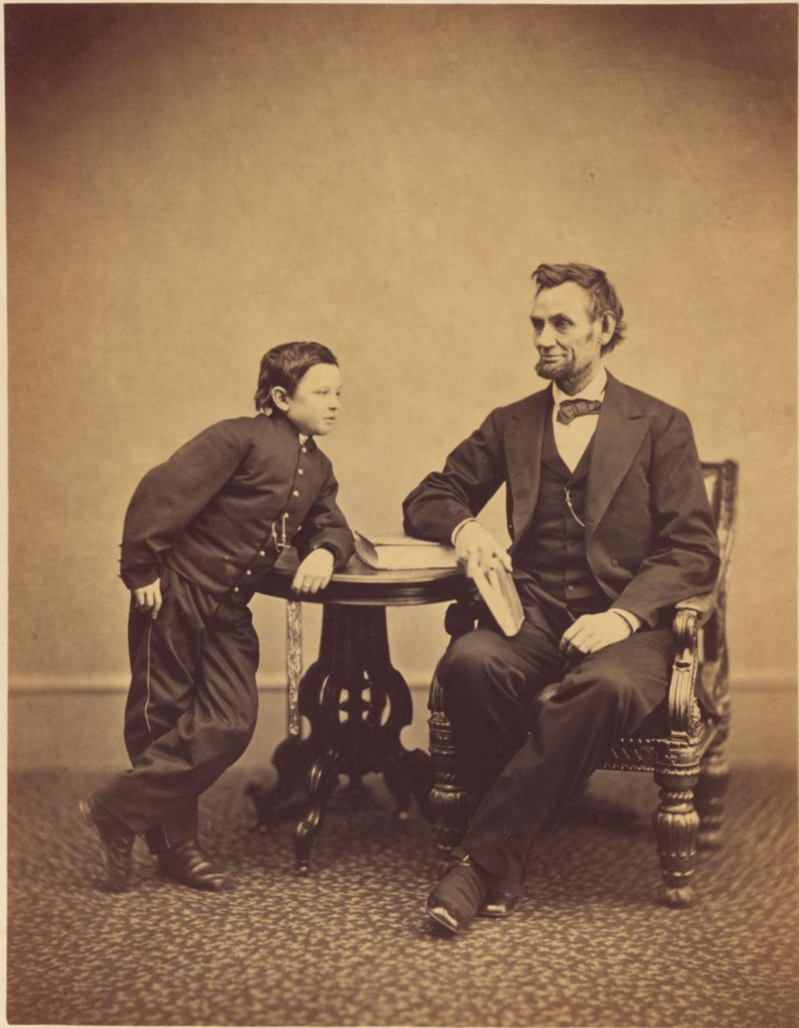
"Abraham Lincoln and His Son Thomas (Tad), Feb. 5, 1865," by Alexander Gardner in "Paper