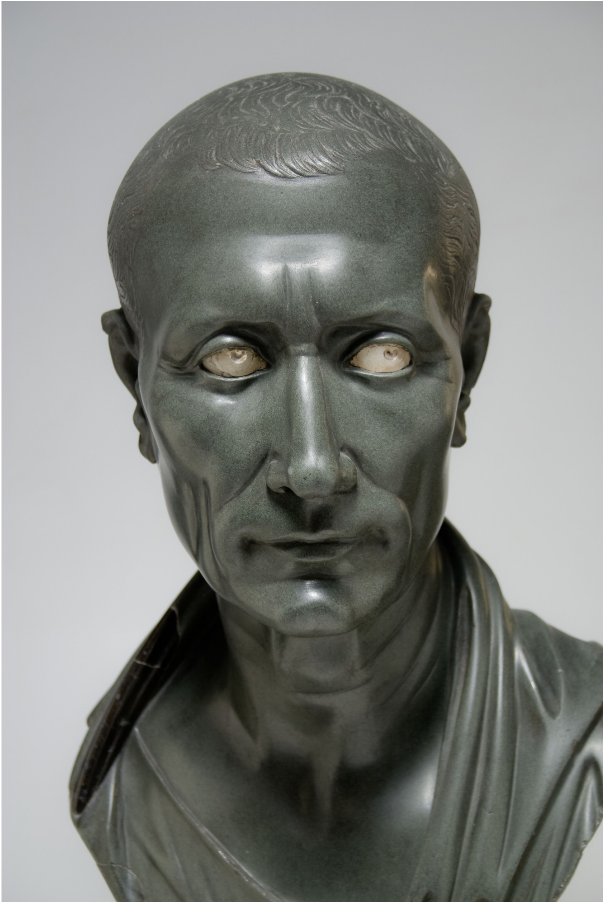
"The Green Caesar," a Roman sculpture from the 1st century B.C./1st century A.D, on view at the Getty Museum.