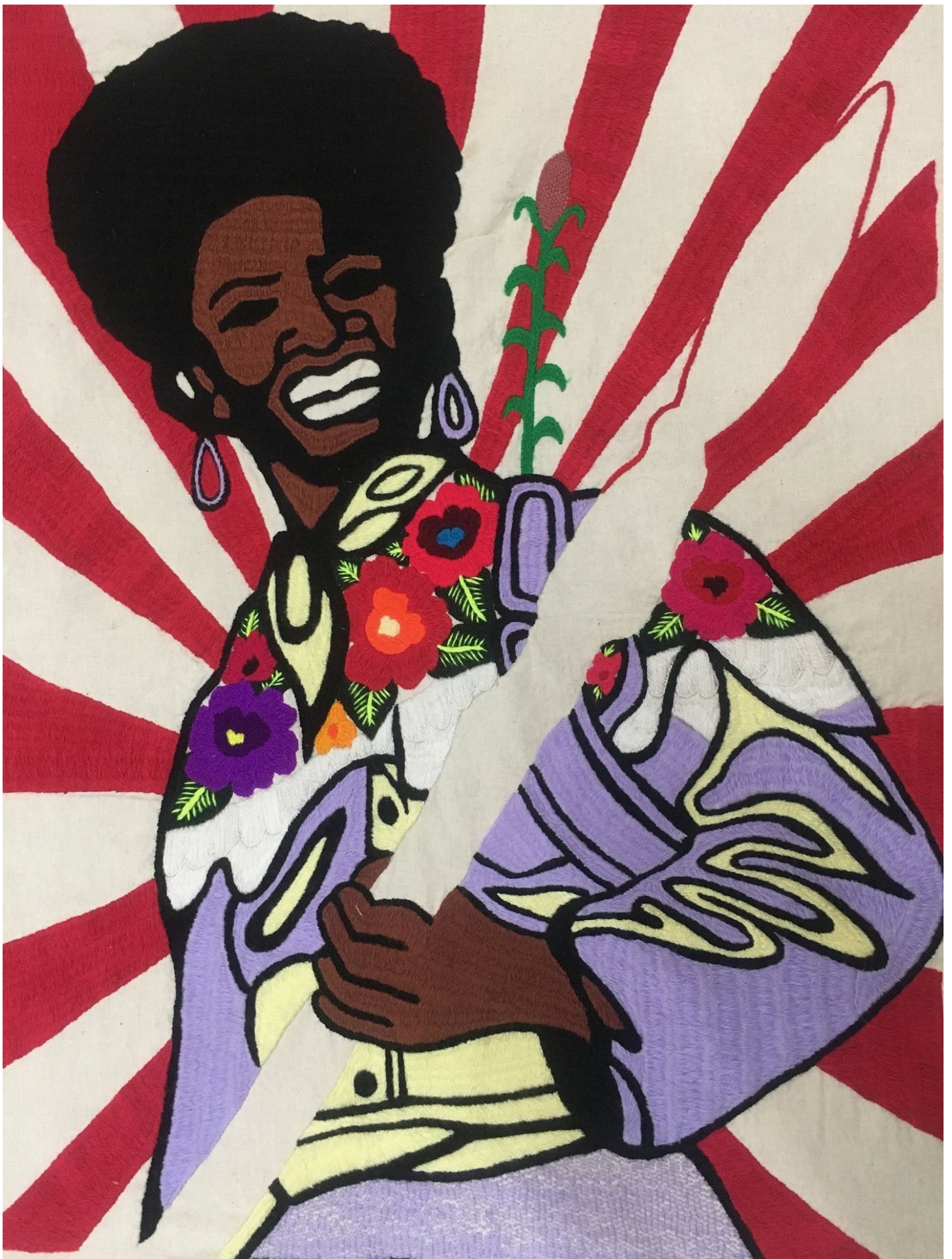
"La Rebeldía se Globaliza Cada Día," a work from the Woman's Zapatista Embroidery Collective in collaboration with Emory Doulgas — on view at LACE.