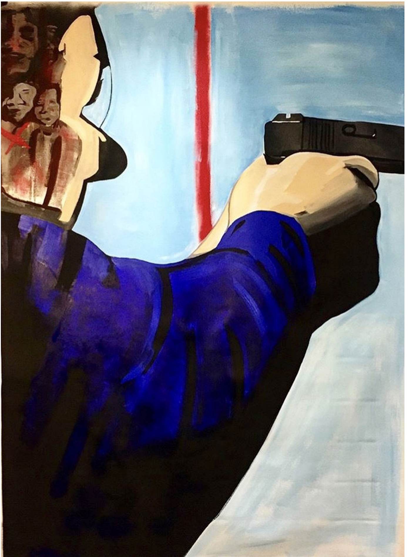
"Judge, Jury, and Executioner," 2018, by Forrest Kirk, on view at Chimento Contemporary.