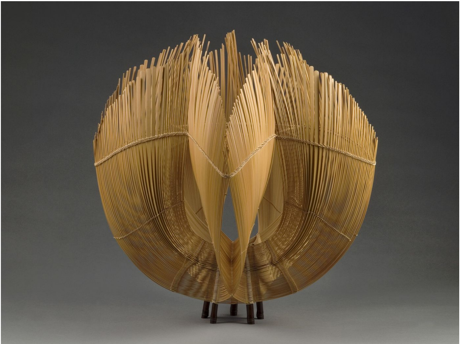
"Fire," 2016, by Yamaguchi Ryuun, at the Craft and Folk Art Museum in Los Angeles.

"Bamboo," at the Craft and Folk Art Museum. Bamboo baskets are often thought of purely as functional objects: vessels that contain and transport food and household goods. An exhibition at CAFAM, however, explores bamboo basketry's sculptural possibilities — including a large-scale bamboo installation inspired by mathematics (such as Fibonacci's sequence and the Golden Ratio) by Japanese architect Akio Hizume. Through Sept. 9. 5814 Wilshire Blvd., Mid-Wilshire, Los Angeles, cafam.org .