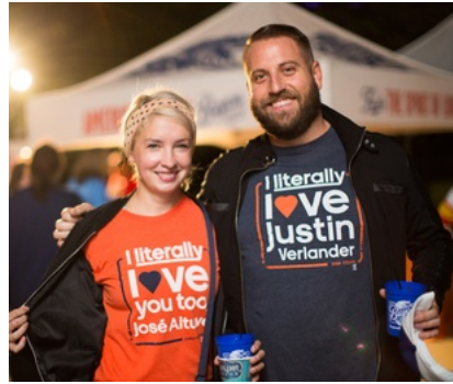
(/news/society/11-20-17-young-professionals-urban-green-h-town-throw-down-hermann-park/) Young professionals celebrate all things Houston at H-Town Throw Down(/news/society/11-20-17-young-professionals-urban-green-h-town-throw-down-hermann-park/)