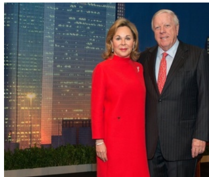
(/news/society/11-20-17-a-conversation-with-a-living-legend-reveals-5-things-we-didnt-know-about-rich-kinder/) Living Legend dinner reveals 5 things we didn't know about Rich Kinder(/news/society/11-20-17-a-conversation-with-a-living-legend-reveals-5-things-we-didnt-know-about-rich-kinder/)