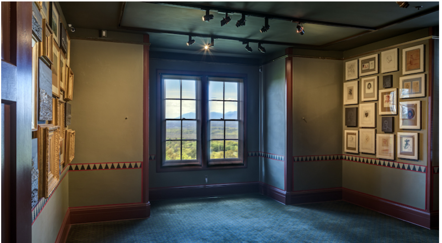
Installation view of Overlook: Teresita Fernández Confronts Frederic Church at Olana

See the photo walk-through, with more from Teresita Fernández, here ( http://www.cubanartnews.org/news/teresita-fernandez-at-olana-sometimes-landscape-is-about-what-you-cant-see/6149 ).