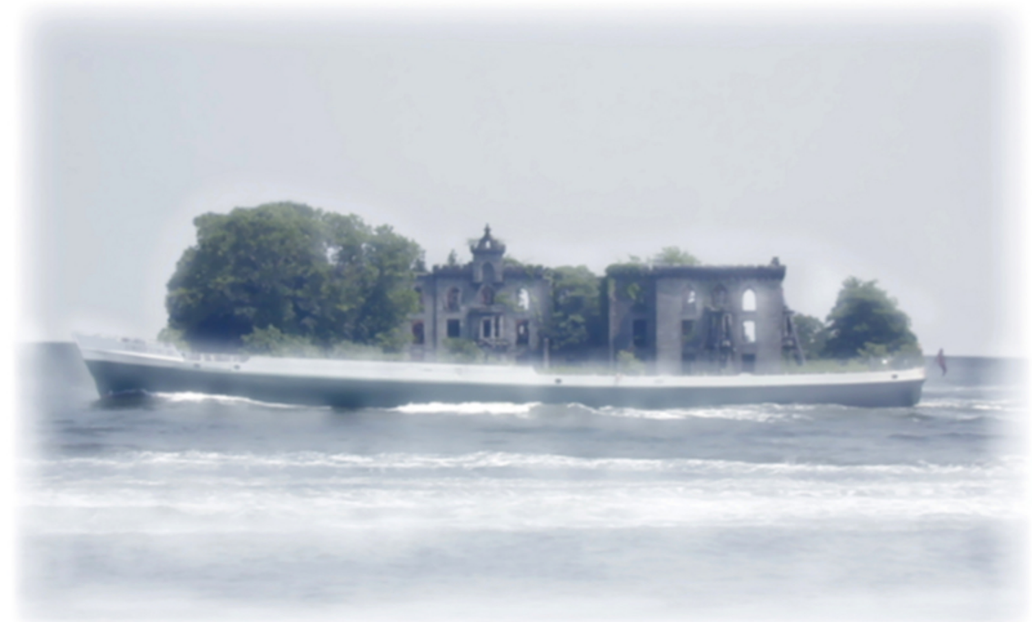
The Prodigious Decade : Arturo Cuenca, Utopyssey: Shipbuilding , 2002

Cuban Artists: The Prodigious Decade. ( http://www.sagamorehotel.com/cuban-art-exhibit ) In Miami Beach, the Sagamore Hotel is hosting this survey of art by the 80s Generation. Curated by Willy Castellanos and Adriana Herrera of Aluna Curatorial Collective with Sebastien Labreau of the Sagamore Hotel, The Prodigious Decade features the work of more than 20 artists—most of them children during the Revolution, or born soon after.