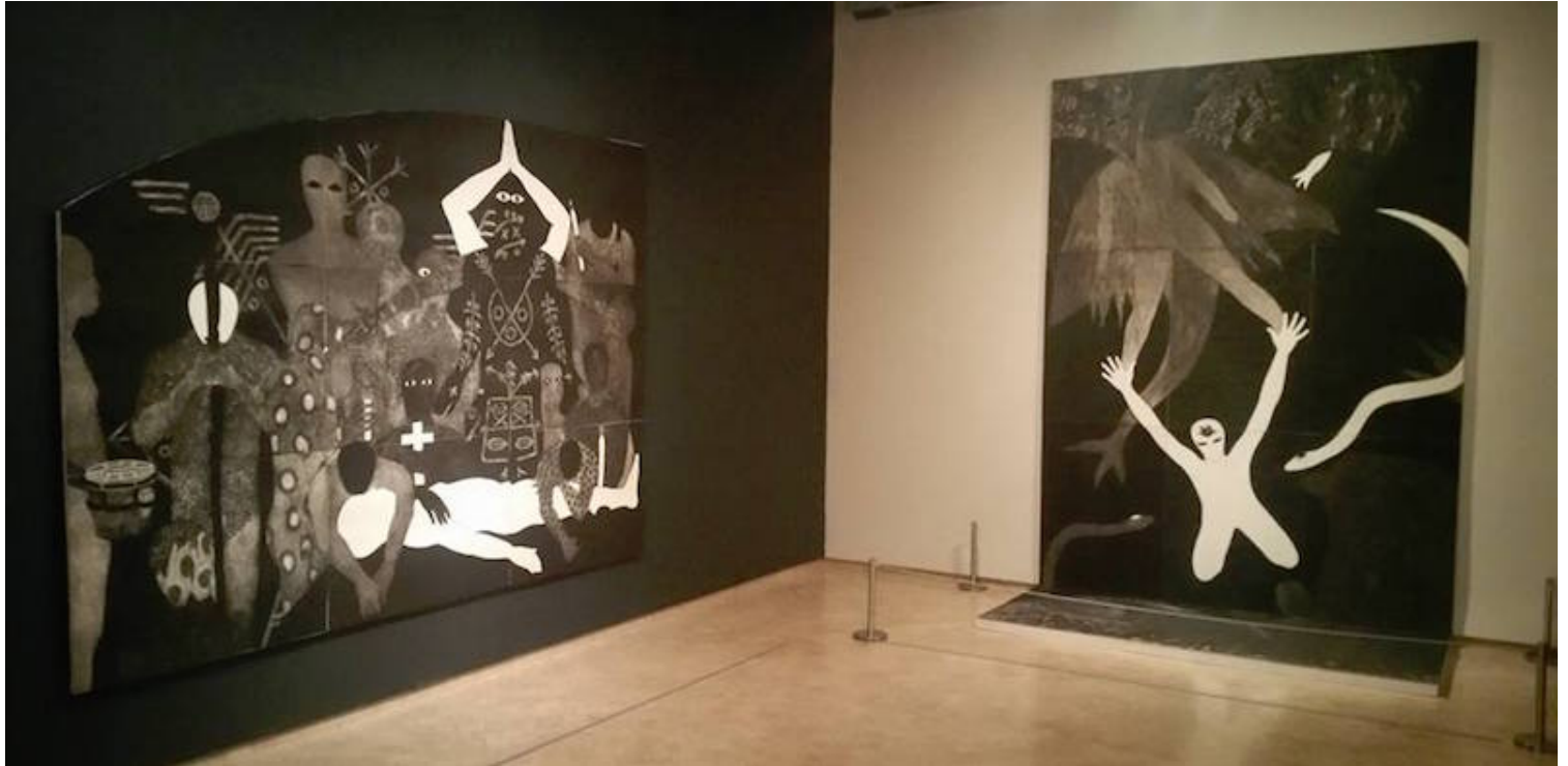
From left, Belkis Ayón, Nloro (Weeping) , 1991, and Sin título (Figura blanca arrojada en el centro) (Untitled: Figure in white, kneeling in center), 1995

"In the more than ten years of our friendship and professional collaboration, Belkis and I spoke about nearly everything," Vives wrote, "but it was not until late 1997, when I curated her last solo exhibition in the United States, Desasosiego/Restlessness , that we discussed her own religious beliefs.