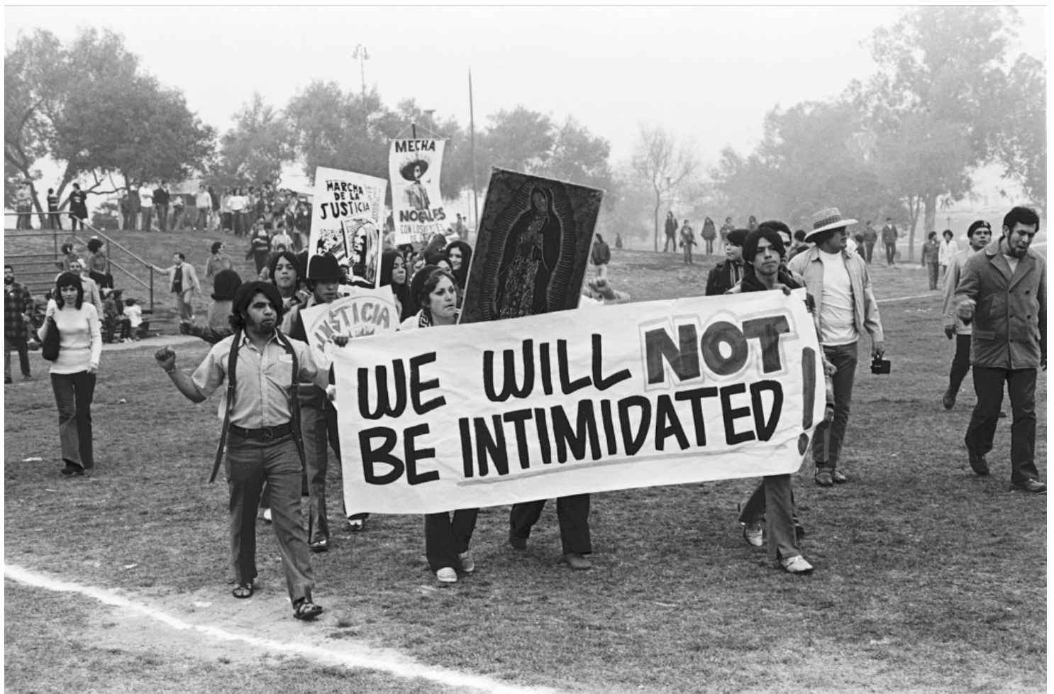
1970 Chicano Moratorium March