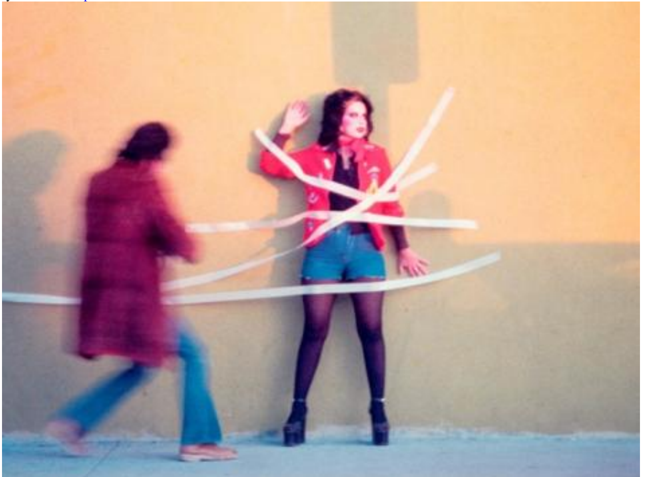
ASCO, Instant Mural , 1974, color photo by Harry Gamboa, Jr., in "ASCO: Elite of the Obscure" at MUAC, University Museum of Contemporary Art, Autonomous University of Mexico.