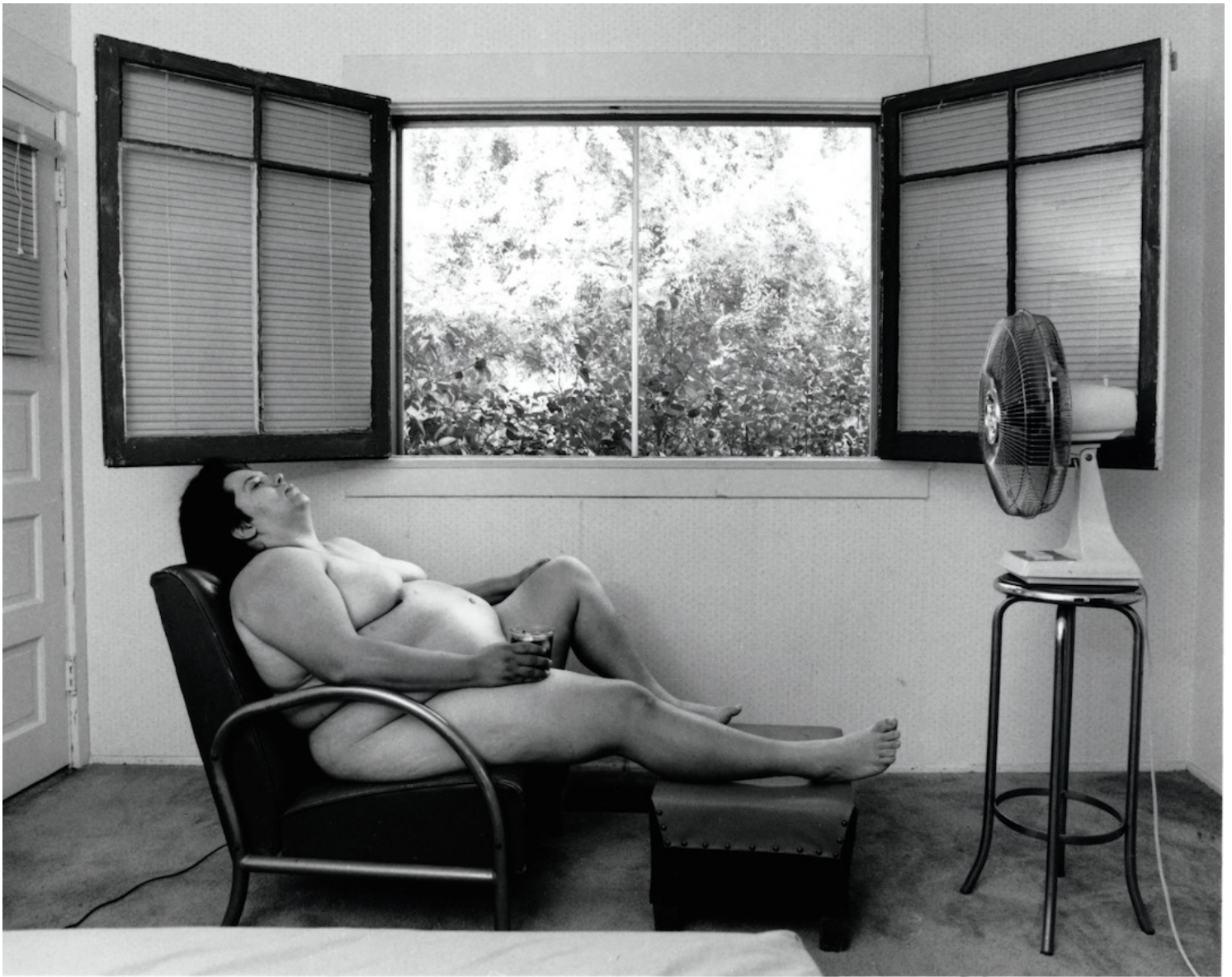
Laura Aguilar. In Sandy's Room , 1989; gelatin silver print; 52 × 42 3/4 in.

The museum exhibitions present another conundrum. Lenders to these prominent shows will likely see the value of their assets increased by the substantive historical scholarship and significant exposure enabled by the initiative. But Latinx artists based in L.A., who are represented in a number of group shows connecting local and international artists around thematic concerns, will continue to struggle to afford materials, rent, and health care. The corrective for this would be for museums to acquire regional artists' work in conjunction with these exhibitions, which the Los Angeles County Museum of Art (LACMA) has done. 5 More direct investment by Southern California museums in local artists of color from disenfranchised communities is required, and more L.A. art collectors need to make it possible through philanthropy. While Latin American collectors and philanthropists have been a highly visible presence at PST: LA/LA events, Los Angeles collectors and philanthropists have not been as well represented. If support for the city's cultural sector is imported rather than cultivated at home, it reduces the likelihood that the city's cultural priorities will relate to the needs of its population.