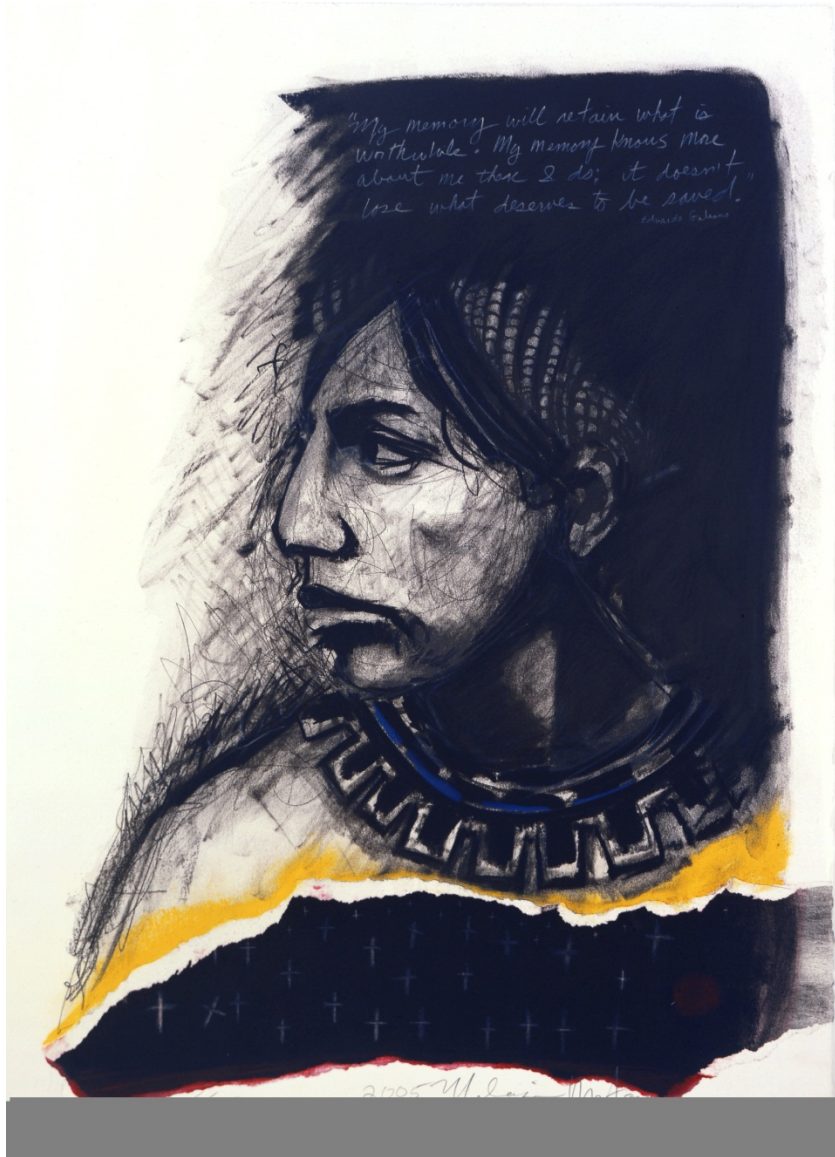
“Memories” 1992.

Montoya produced Memories as part of a collective artistic counter-quincentenary that challenged official celebrations of the “discovery of America” in 1492. In juxtaposing an indigenous portrait with an evocation of the Catholic Church, Montoya mobilized contending formal properties through collage and color, using these to engage the viewers and lead them to the contrasting texts in the image. The first text, in the lower left-hand corner, is the word text itself, suggested by three crosses in which the middle one tilts to the right, forming an “x.” This text—with its missing “e”—is an absence that must be remembered: dead bodies, burned indigenous texts, suppressed education for the indigenous, and even the censored Florentine Codex. The second text is the passage by Galeano, the noted Uruguayan writer whose work mixes genres in the same way Montoya mixes media in order to conjure up the memory of the Conquest and its place in the history of the Americas. The irony here is that the passage recalls