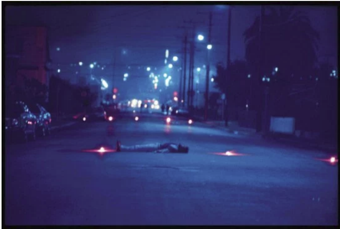
Decoy Gang War Victim – Asco (1974)