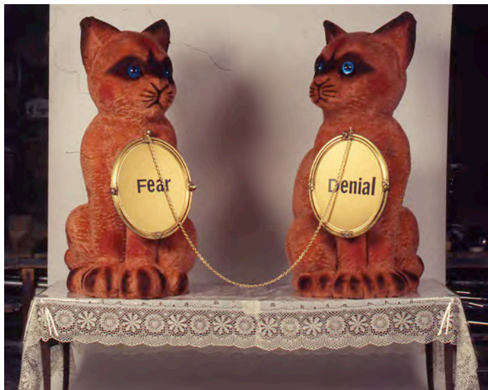
Pepón Osorio, Fear and Denial , 1997. Mixed media, 92 × 96 × 32 inches. Collection of the Brooklyn Museum, New York.

Just as Lonely Soul conjures up Anima Sola , it overlays another, more contemporary, figure onto the piragüera : Amina Lawal, a