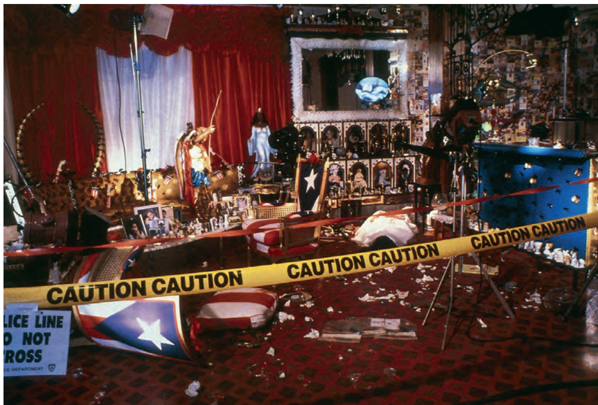
Figure 1. Pepón Osorio, Scene of the Crime (Whose Crime?) , 1993. Mixed media and video installation, as shown at the 1993 Biennial Exhibition, Whitney Museum of American Art, New York. Collection of the Bronx Museum of the Arts, New York.